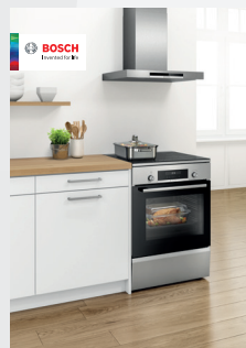
Freestanding Cooker Range.

This publication uses vegetable based inks and environmentally responsible paper. Printed on Impress Satin stock, which is Forest Stewardship Council® (FSC®) certified, Mixed Source pulp from Responsible Sources.