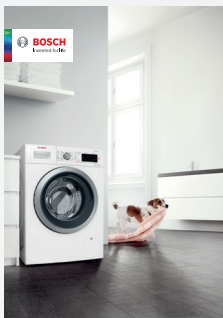
Washing Machine Range.