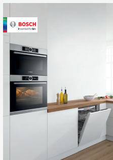
Oven and Compact Range.