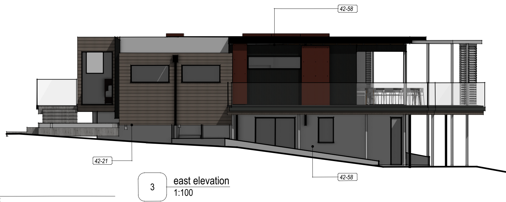
3 east elevation 1:100