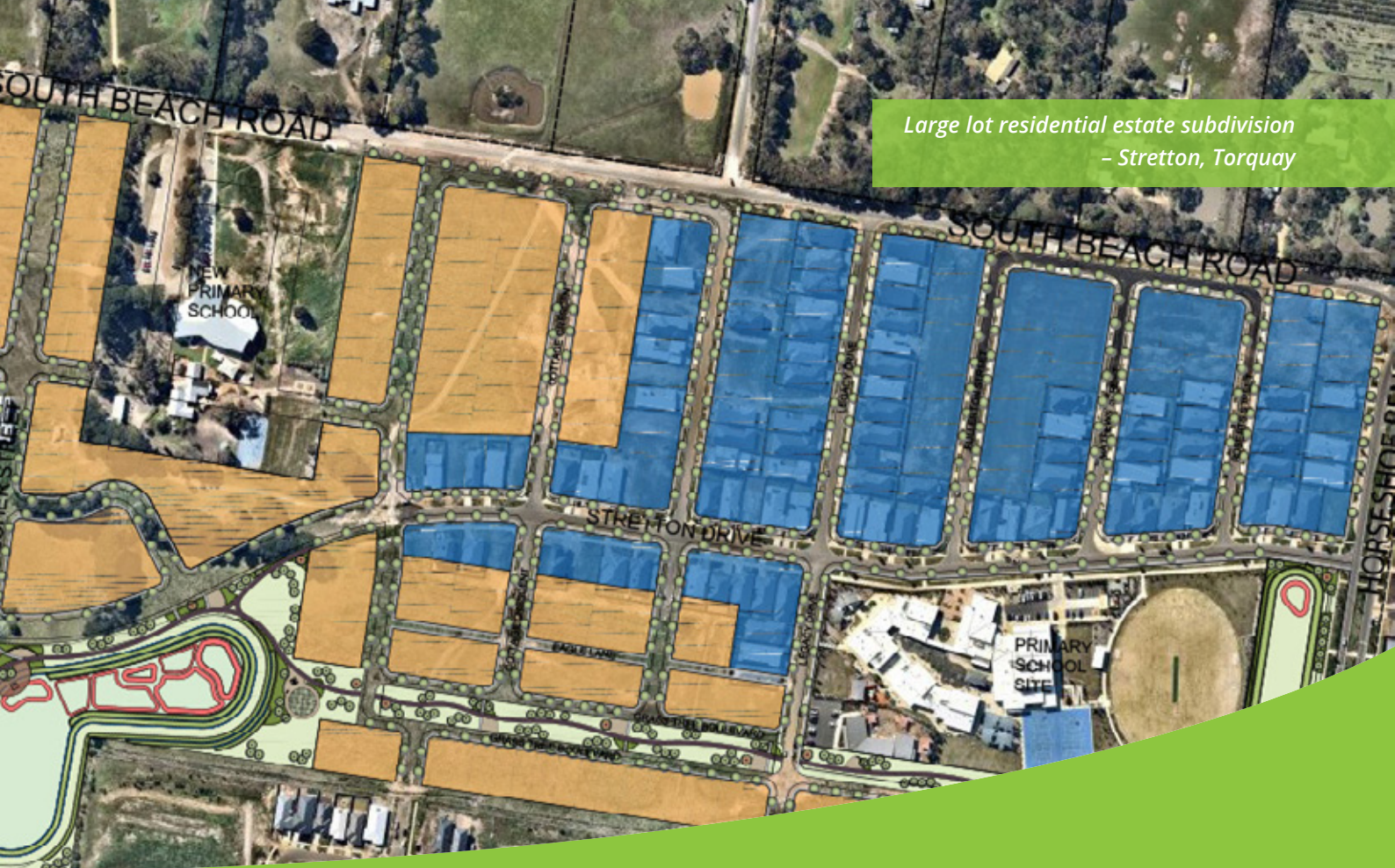
Large lot residential estate subdivision – Stretton, Torquay