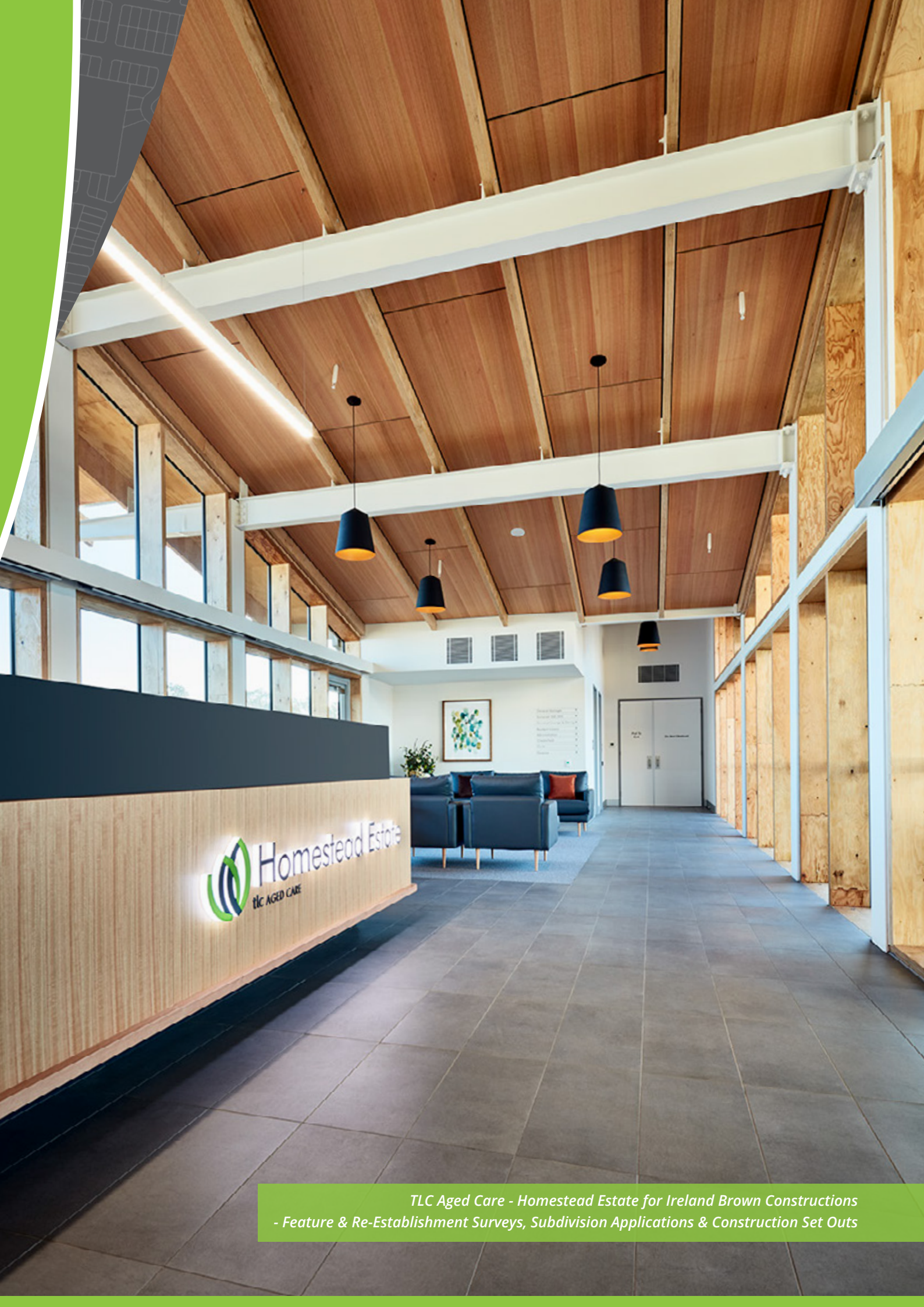
TLC Aged Care - Homestead Estate for Ireland Brown Constructions - Feature & Re-Establishment Surveys, Subdivision Applications & Construction Set Outs