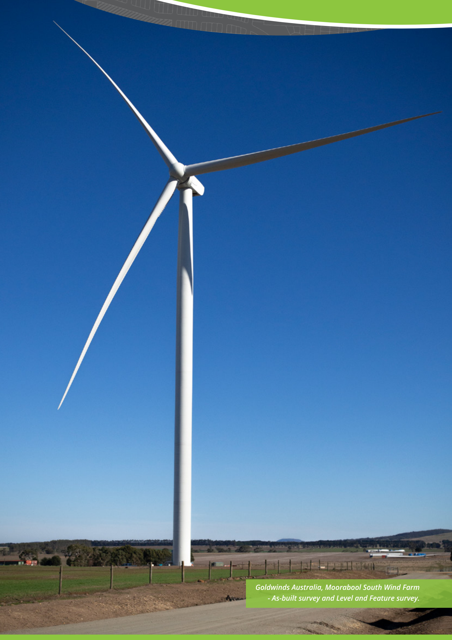
Goldwinds Australia, Moorabool South Wind Farm - As-built survey and Level and Feature survey.