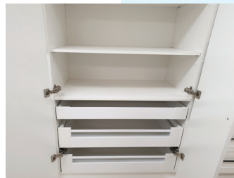
PANTRY WITH INTERNAL DRAWERS