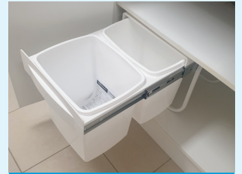
UNDER SINK BIN