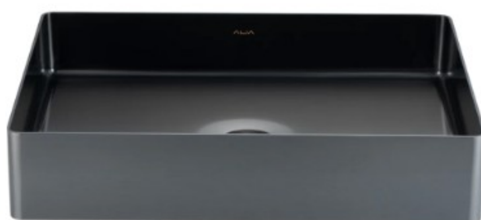
Gunmetal Grey AG-5040GM - Bathroom Basin 500 x 400 x 100 mm