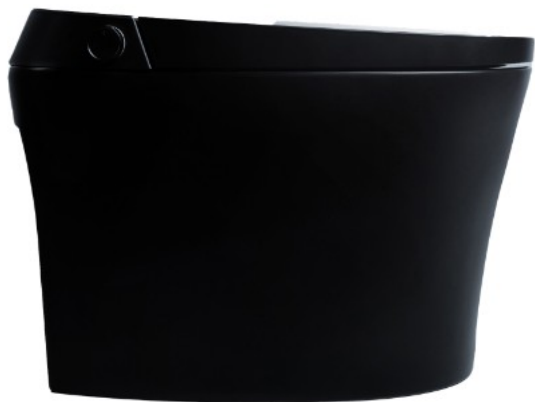
Matte Black AG-ST10003B - Digital / remote controlled smart toilet