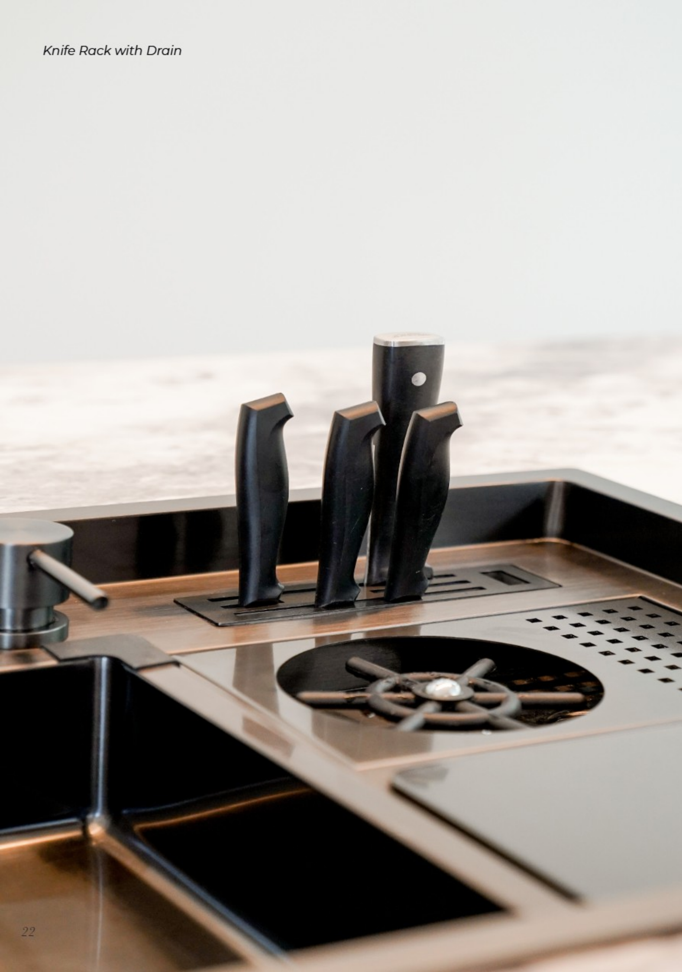
Knife Rack with Drain