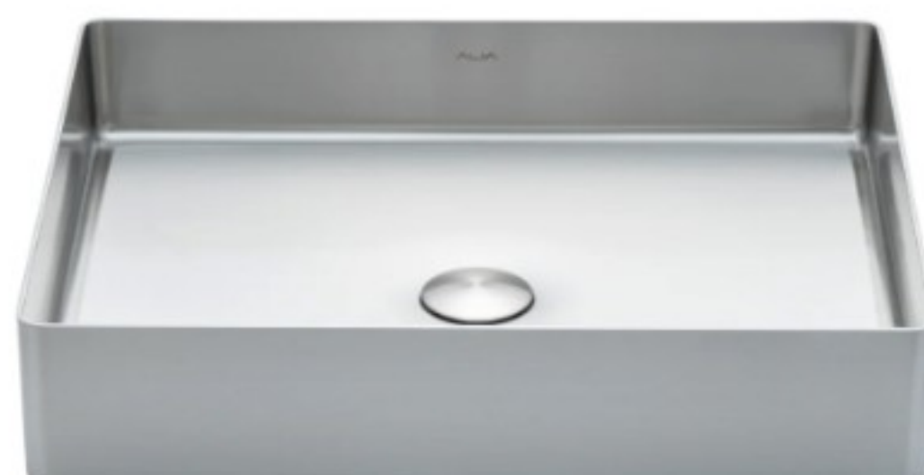
Brushed Silver AG-5040BS - Bathroom Basin 500 x 400 x 100 mm