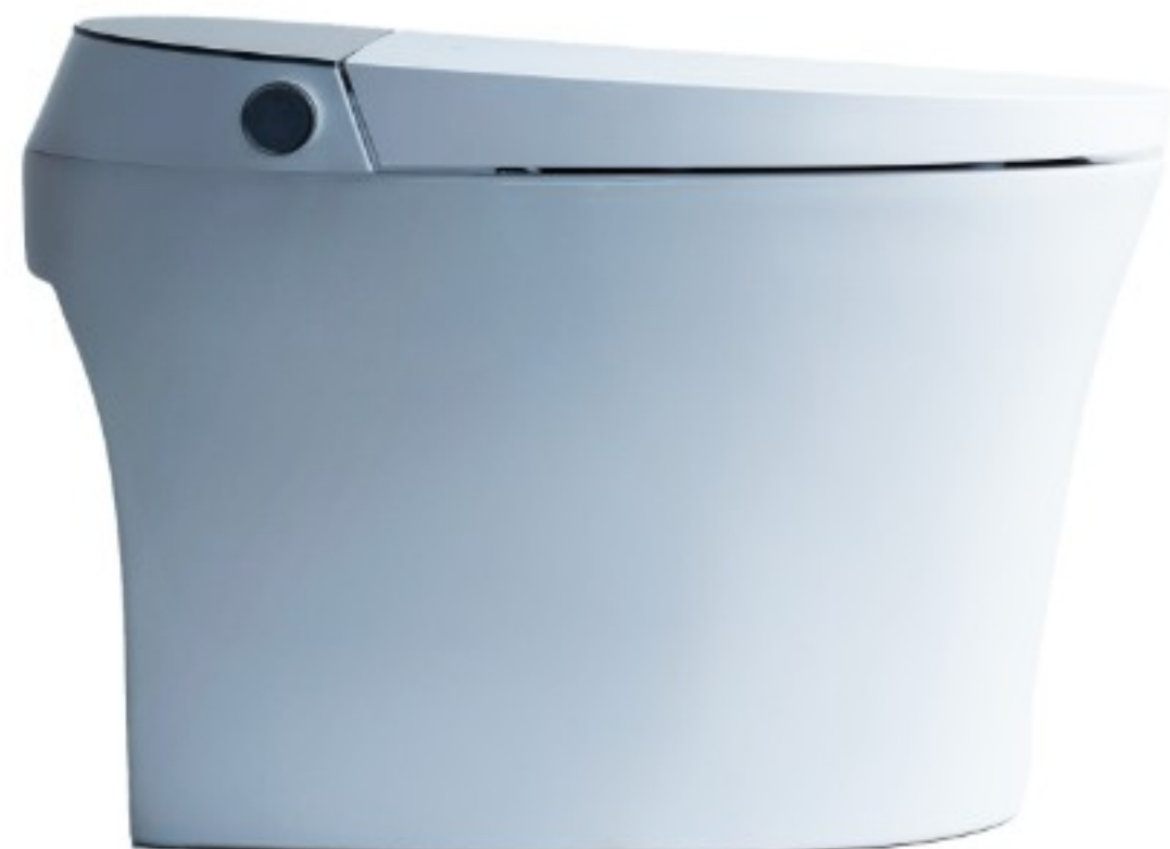
White AG-ST1000 - Digital / remote controlled smart toilet