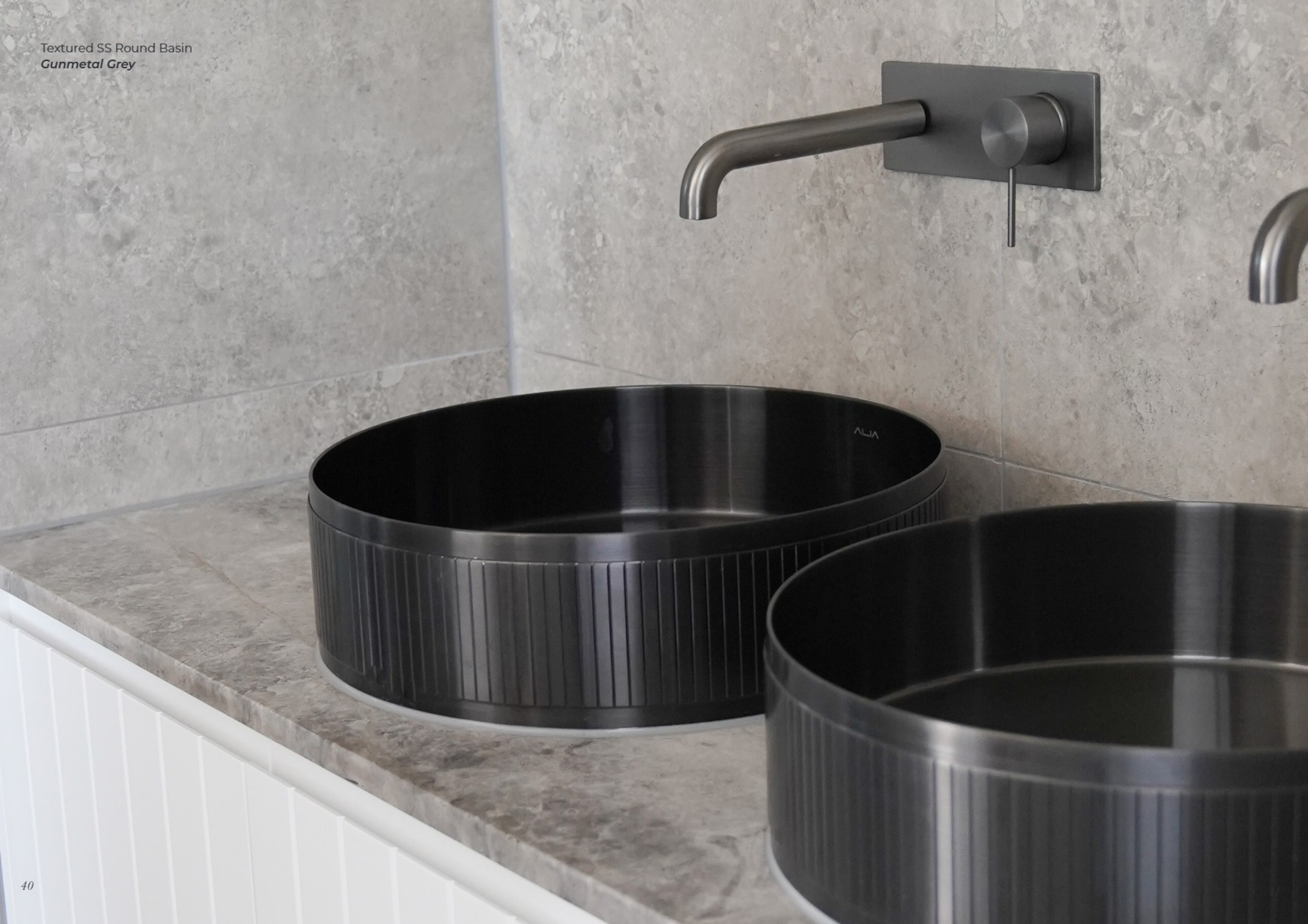
Textured SS Round Basin Gunmetal Grey