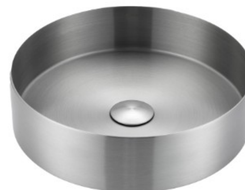
Brushed Silver AG-4011BS - Bathroom Basin 400 x 100 mm