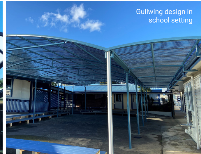
Gullwing design in school setting