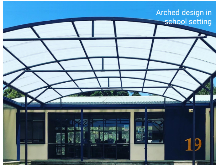
Arched design in school setting

Straight rooflines provide a modern look to suit box style buildings. There is a 5% gradient for water flow.