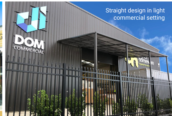
Straight design in light commercial setting