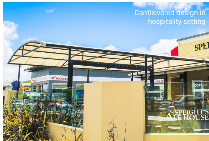
Cantilevered design in hospitality setting