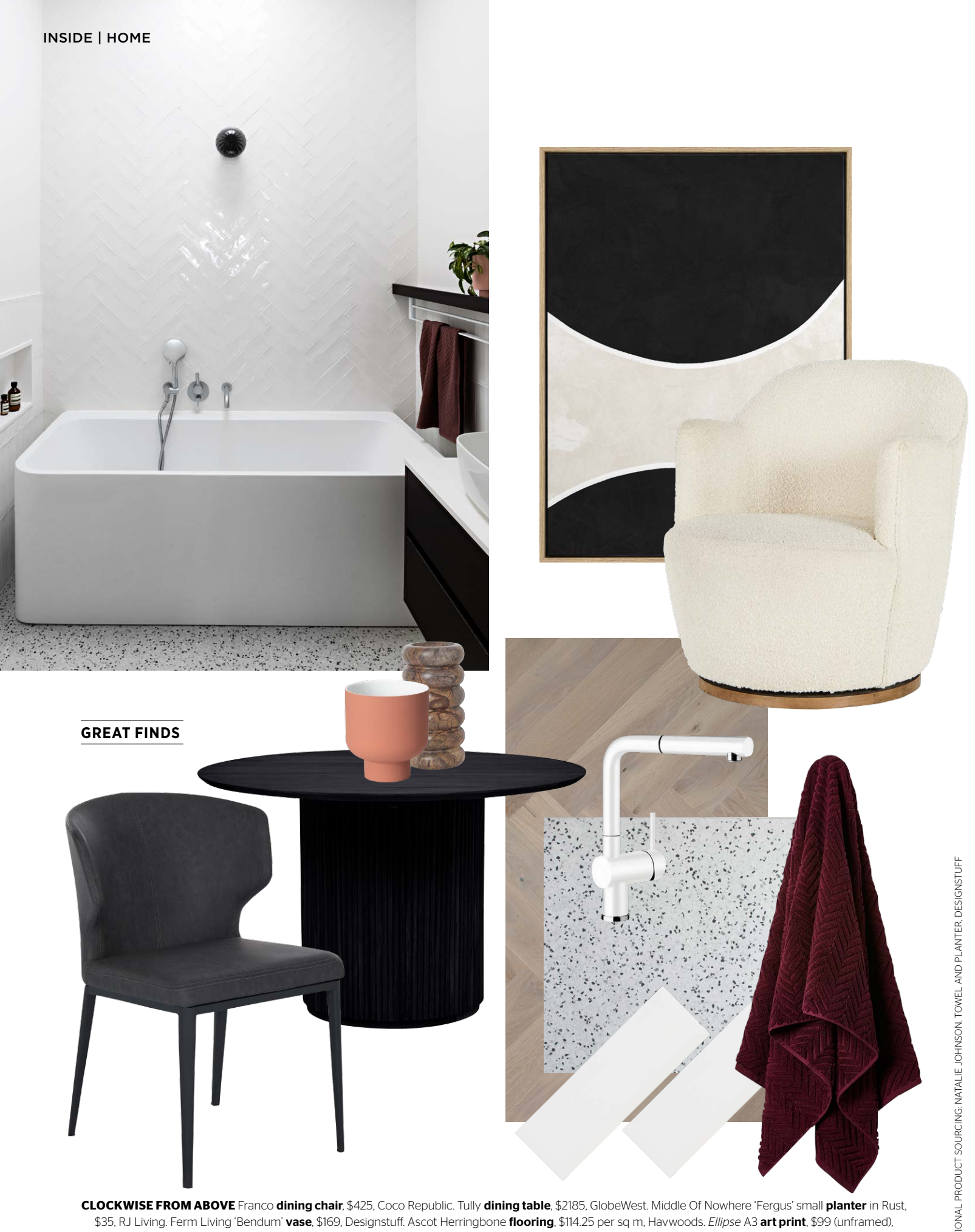
Urban Road. Milou Swivel armchair, $1595, Coco Republic. Home Republic 'Mimosa' textured bath towel in Plum, $39.99, Adairs. Bevelled white matt tile, $44.95 per sq m, National Tiles. Redfern Terrazzo tile (600mm x 600mm), $48 per sq m, Tile Cloud. Blanco kitchen mixer , $929, Winning Appliances.