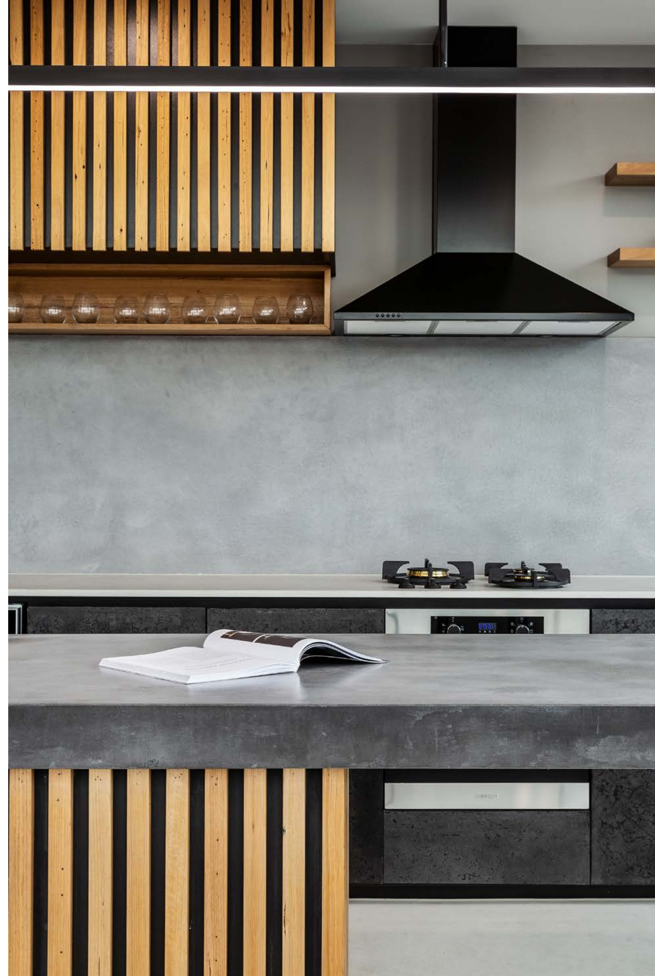
Right. Concrete Benchtops, Door Panels and Splashbacks. Concrete Collective Showroom by Rachcoff Vella Architects.