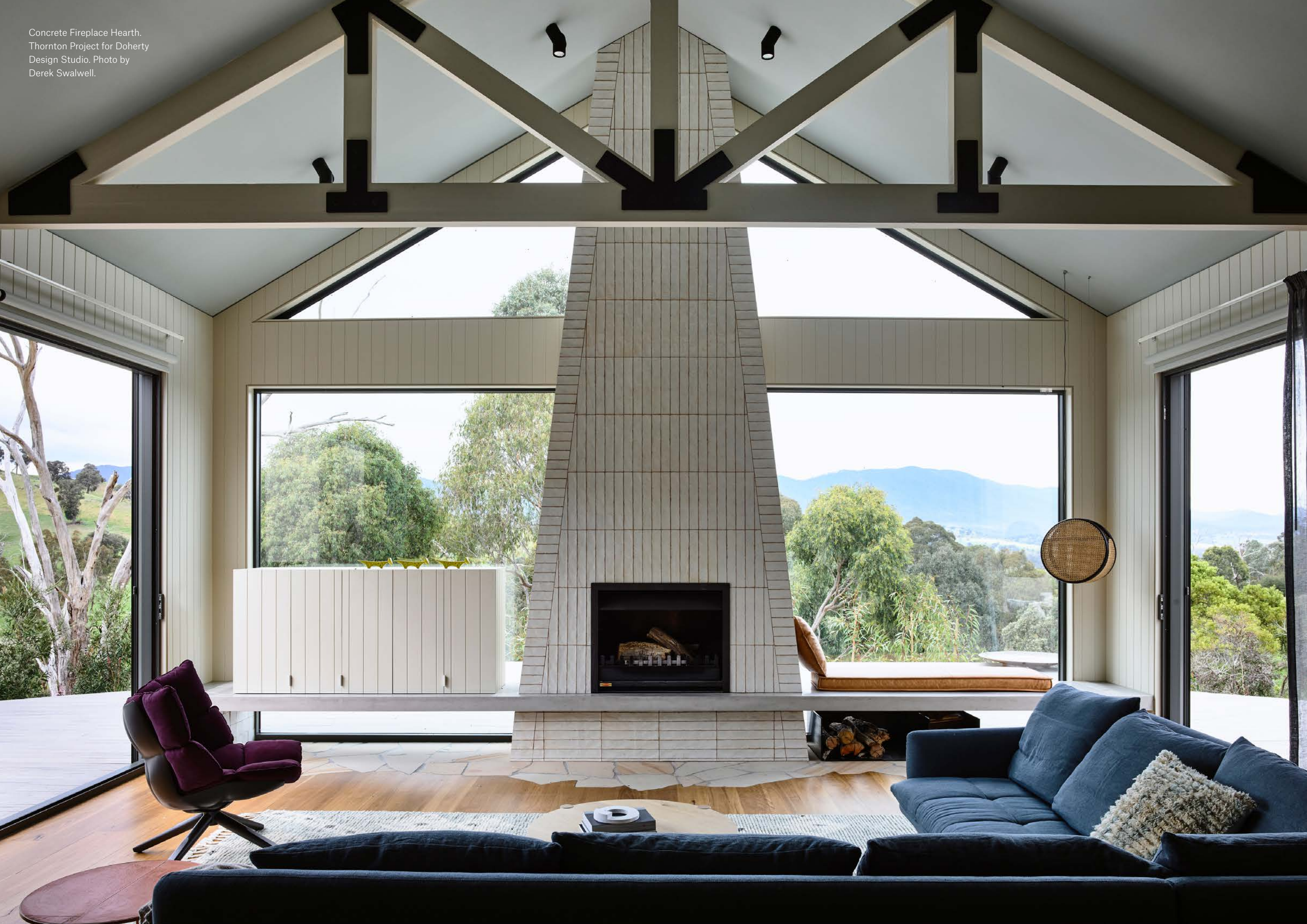
Concrete Fireplace Hearth. Thornton Project for Doherty Design Studio.