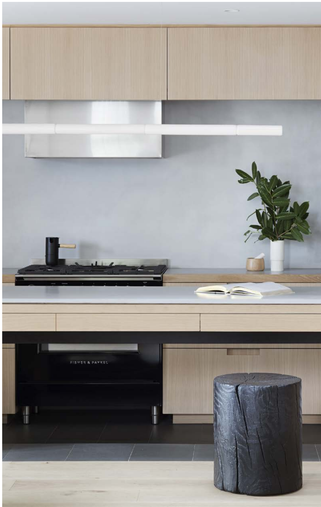
Concrete Benchtops, Panelling and Splashbacks. Connect Six House by Whiting Architects.