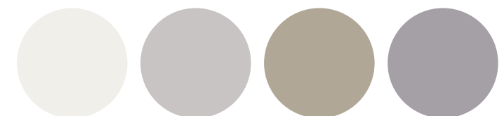
1. Ash 2. Smoke 3. Desert 4. Nickel

Our standard colour selection ranging from light to dark: