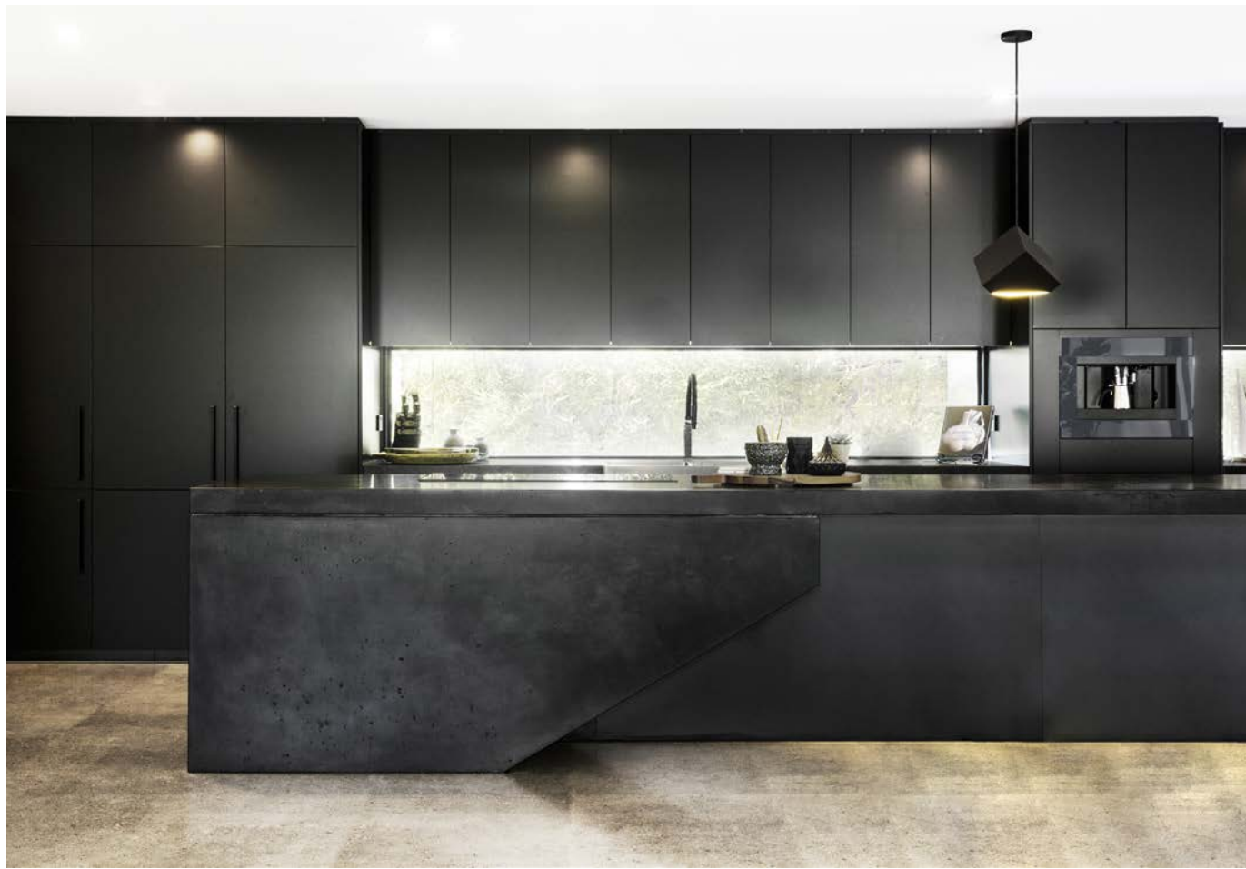
Left. Concrete Benchtops and Custom Wrap Around in our Lower Plenty project. Design by Concrete Collective.