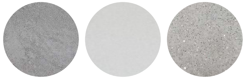
a. Hand trowelled b. Cream c. Salt and Pepper

Concrete Collective offer an extensive range of custom finishes developed in-house through extensive experimentation.