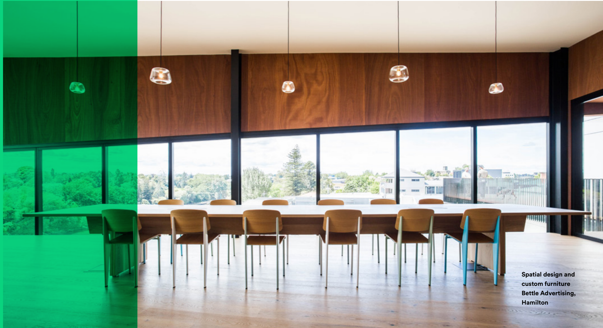
Spatial design and custom furniture Bettle Advertising, Hamilton

Connectivity is the linchpin for a collaborative workplace, enabling staff to work effectively with each other across space and time. Getting this right unleashes the potential of both the physical and digital workspace, where mobile and team work is a reality.