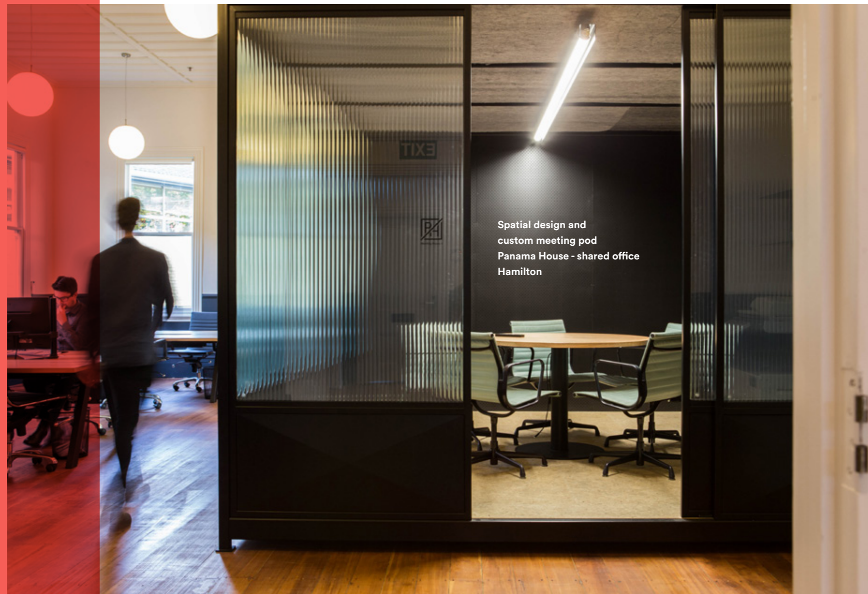
Spatial design and custom meeting pod Panama House - shared office Hamilton

The freedom and ability to exercise ones autonomy is an essential part of being human. It turns out that exercising this in the workplace - ranging from where to work, to turning the temperature up or down to suit - helps employees to work more productively.