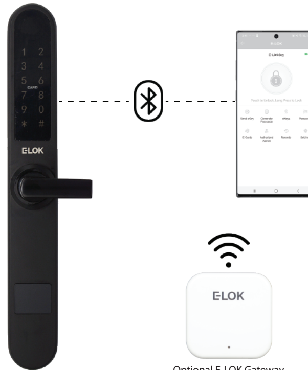
Optional E-LOK Gateway (for remote Wi-Fi access)