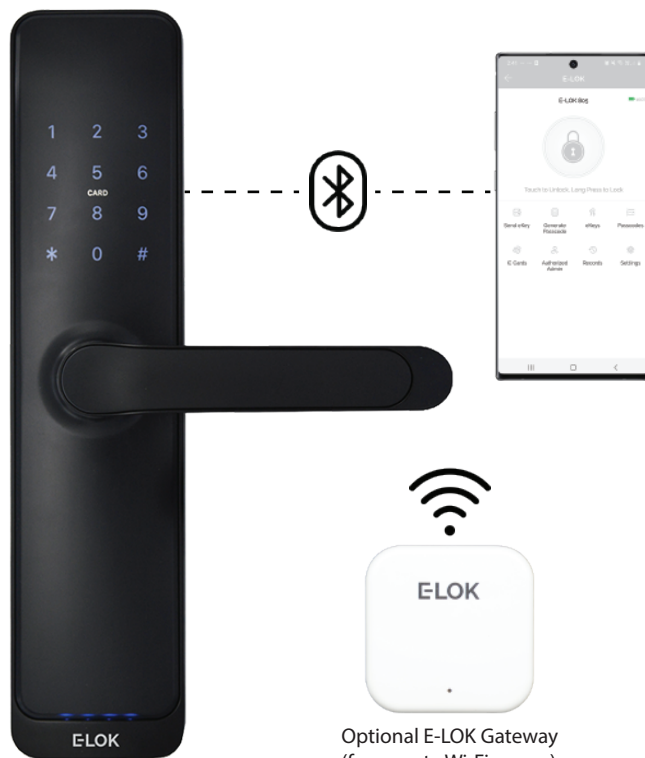
Optional E-LOK Gateway (for remote Wi-Fi access)