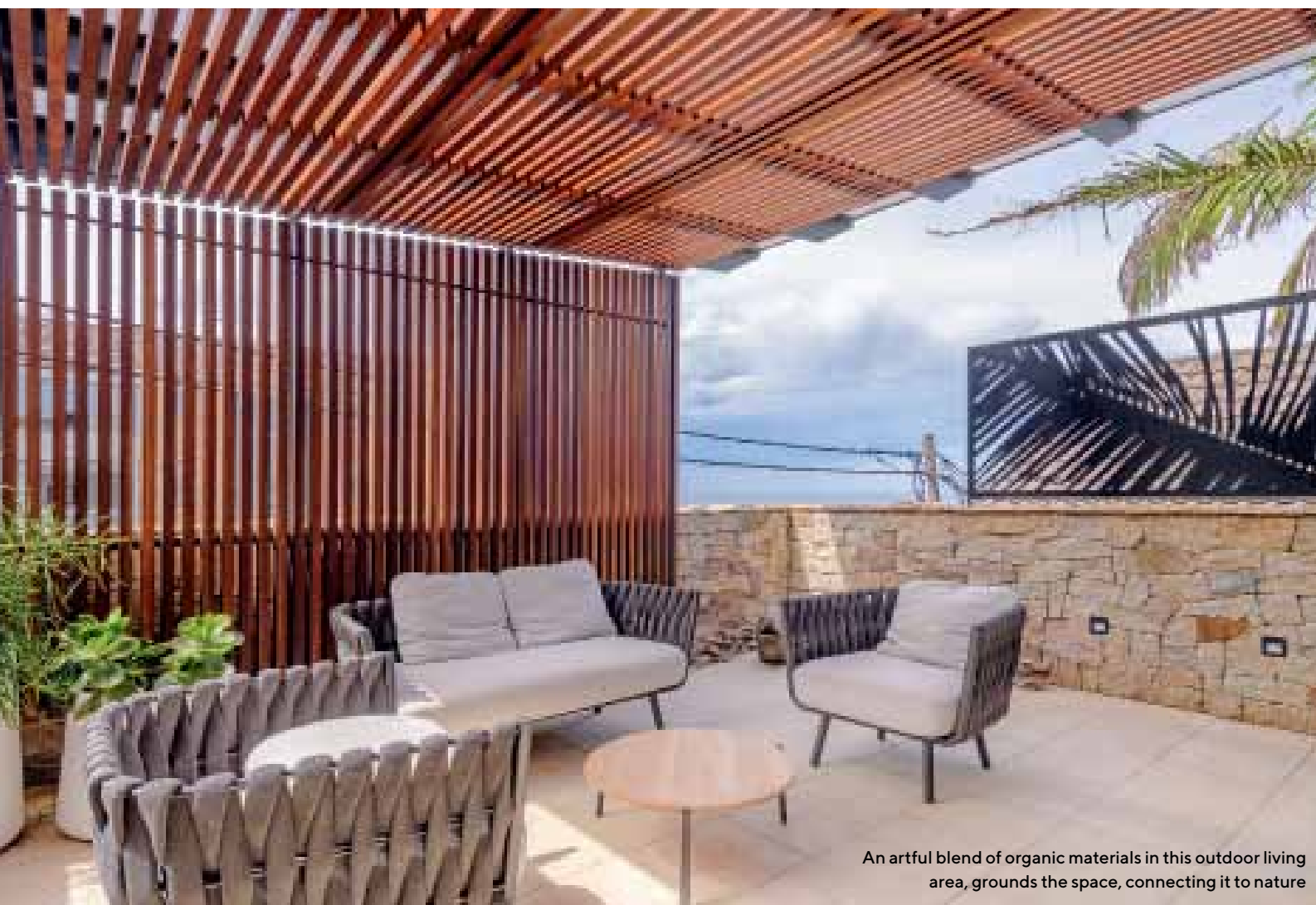
An artful blend of organic materials in this outdoor living area, grounds the space, connecting it to nature