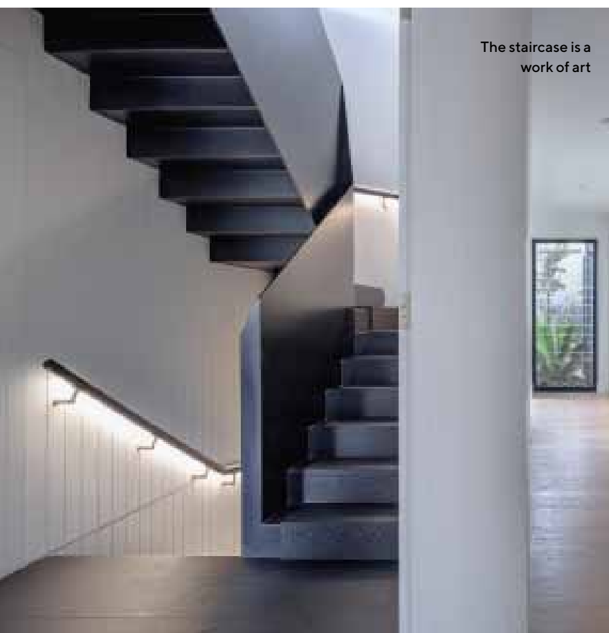
The staircase is a work of art