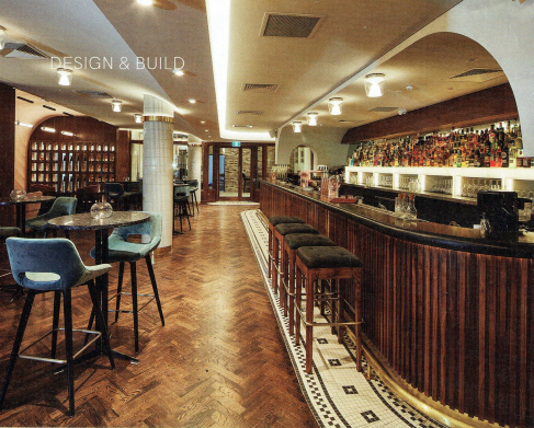
LEFT: The bar at Mullane's employs talented bartending staff to create a more high-end drinks experience