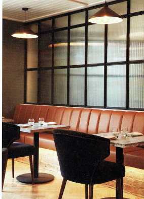
RIGHT: Sandy coloured timber floors, light brickwork and tan leathers add to the coastal Italian aesthetic of Sarino's

welcome in the venue day or night - whether they're popping in for a coffee before work or for after work drinks - people can feel comfortable in the space in heels or workboots.