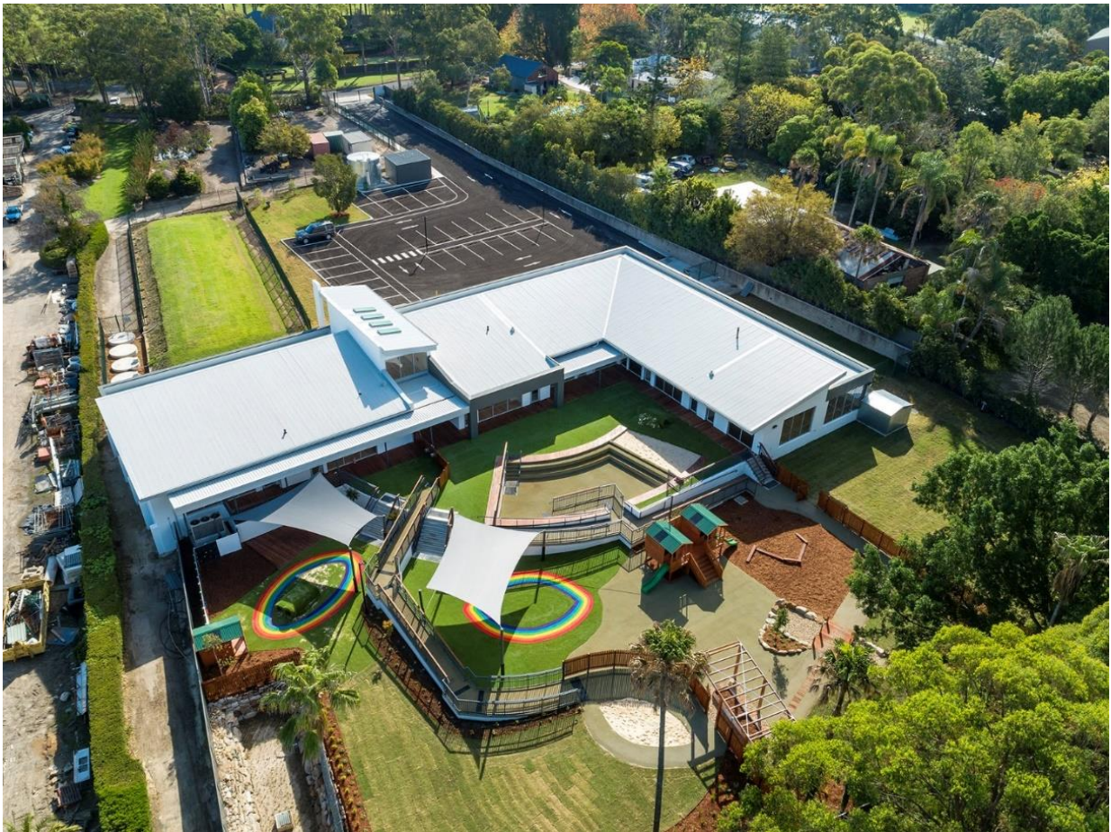
ArtMade Childcare Design Project – Dural NSW