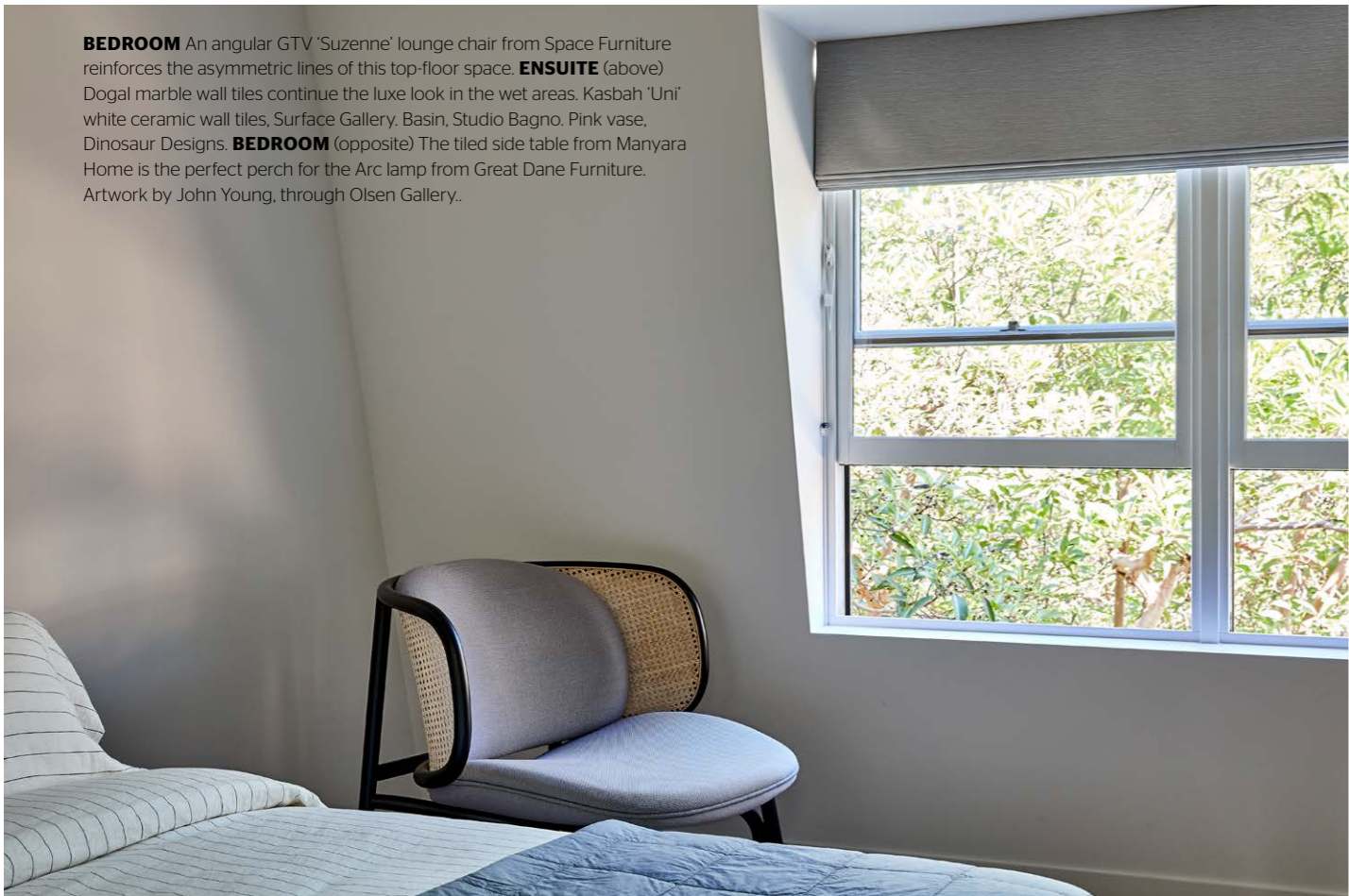
BEDROOM An angular GTV 'Suzenne' lounge chair from Space Furniture reinforces the asymmetric lines of this top-floor space. ENSUITE (above) Dogal marble wall tiles continue the luxe look in the wet areas. Kasbah 'Uni' white ceramic wall tiles, Surface Gallery. Basin, Studio Bagno. Pink vase, Dinosaur Designs. BEDROOM (opposite) The tiled side table from Manyara Home is the perfect perch for the Arc lamp from Great Dane Furniture. Artwork by John Young, through Olsen Gallery.

ADDITIONAL PRODUCT SOURCING: CORINA KOCH