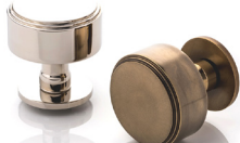
DK1020: 'Bartlett' Solid Brass Door Knob