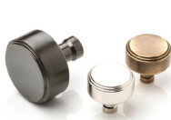
CP1004: 'Bartlett' Solid Brass Cabinet Pull