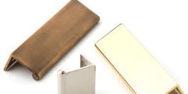
EP1001: 'Bartlett' Solid Brass Small Round Edge Pull