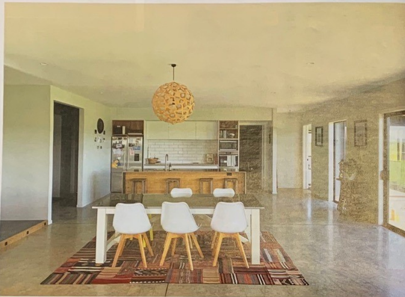
Schaw Building specialises in residential new builds, renovations and rural work.