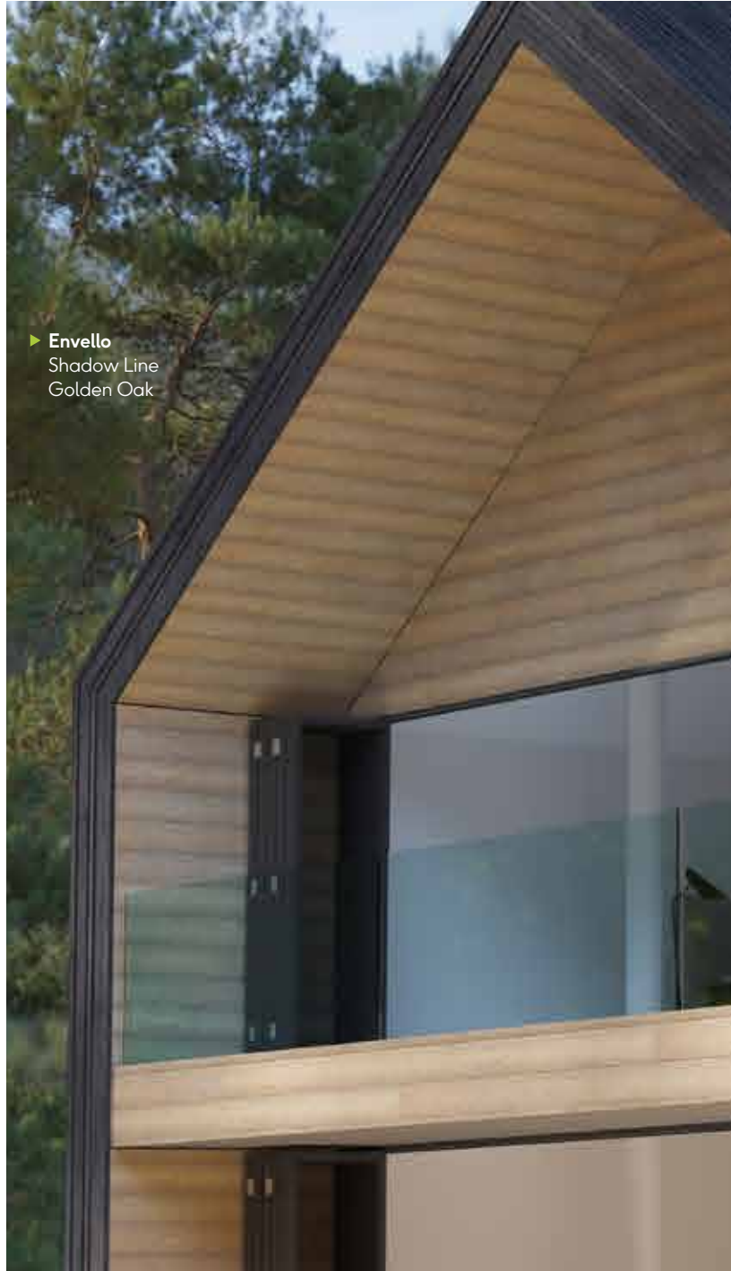
► Envello Shadow Line Golden Oak