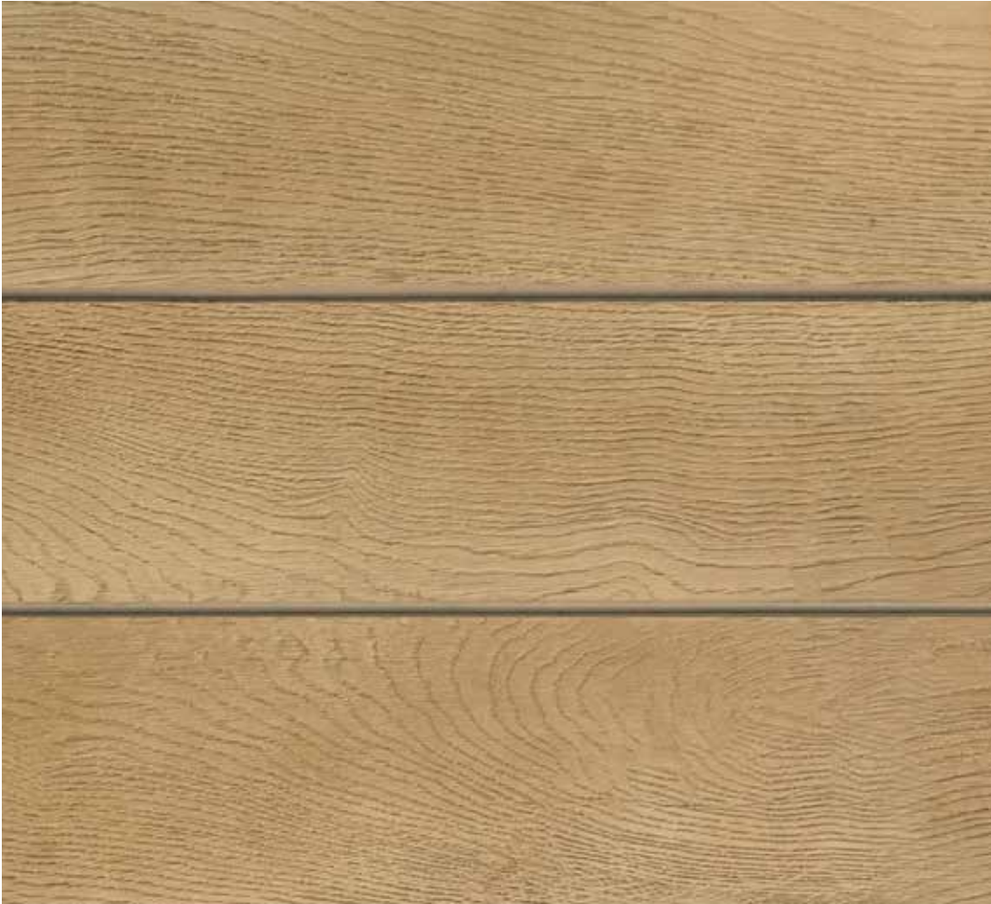
◀ Envello Shadow Line Golden Oak

Crafted to be perfectly imperfect Envello cladding is hand-coloured to enhance its realistic appearance.