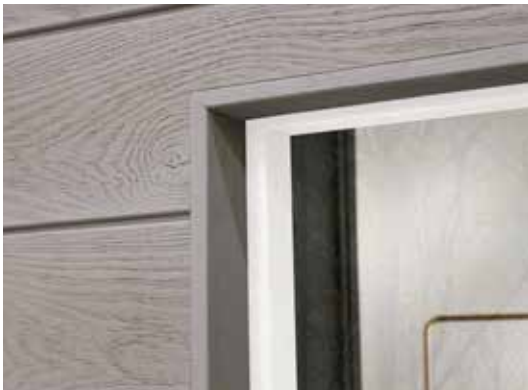
▲ Envello Shadow Line Smoked Oak

Corner profiles and fascia boards add distinction to corners of buildings, window and door reveals, soffits and much more. Our trims are specially selected to fit our profile, for a cleaner look and a faster, easier install.