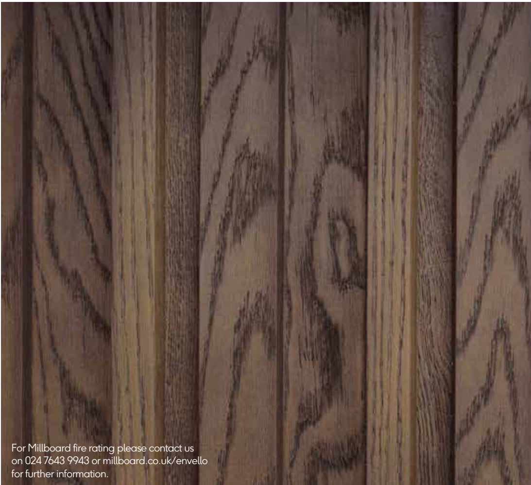
◀ Envello Board & Batten Antique Oak

Crafted to be perfectly imperfect Envello cladding is hand-coloured to enhance its realistic appearance.