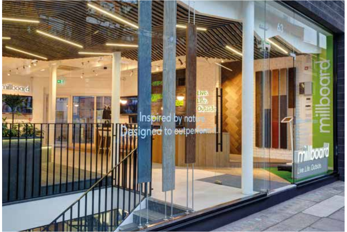
Millboard Showroom ▶ London Design Hub Goswell Road, EC1V 7EN