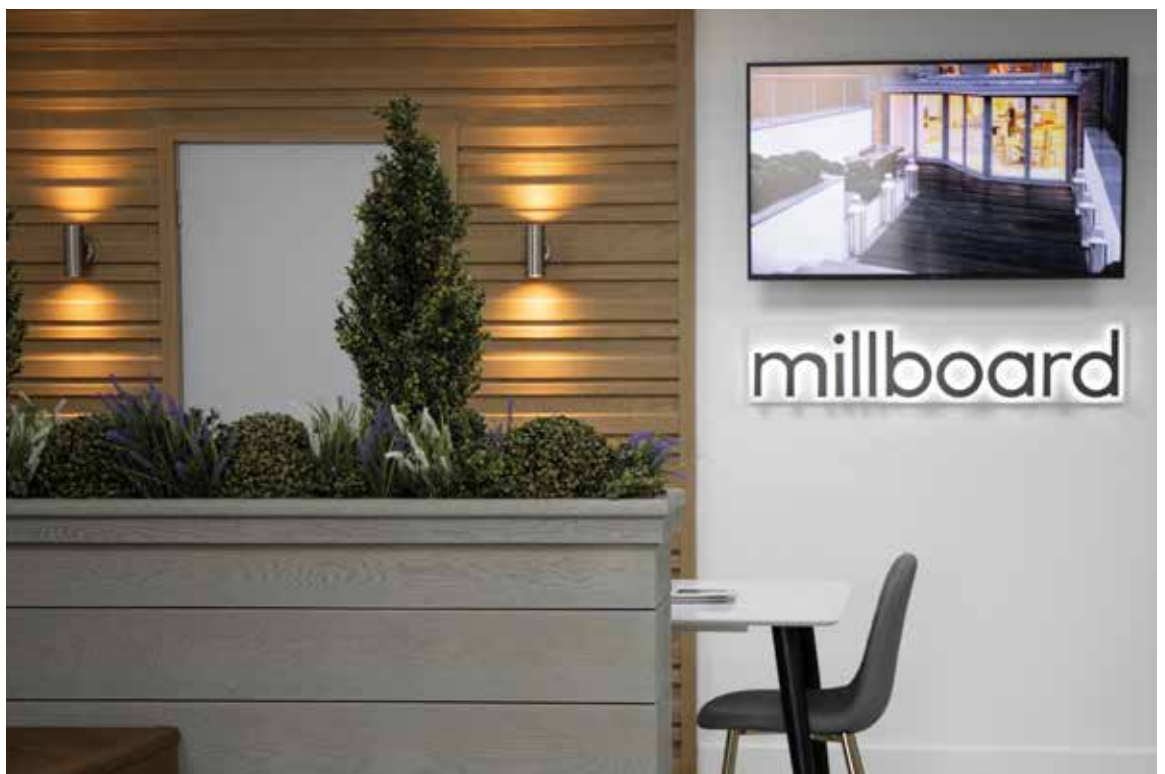
Millboard Showroom ▶ Midlands Design Hub Bodmin Road, CV2 5DB

Each showroom includes striking displays of the many creative ways in which Millboard can be used – both innovative laying styles and alternative uses.