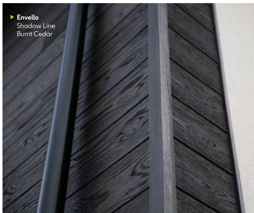
► Envello Shadow Line Burnt Cedar