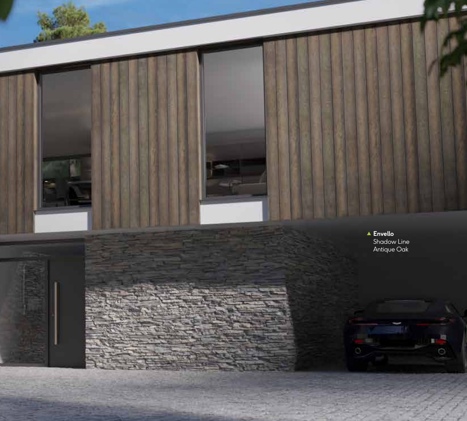
▲ Envello Shadow Line Antique Oak