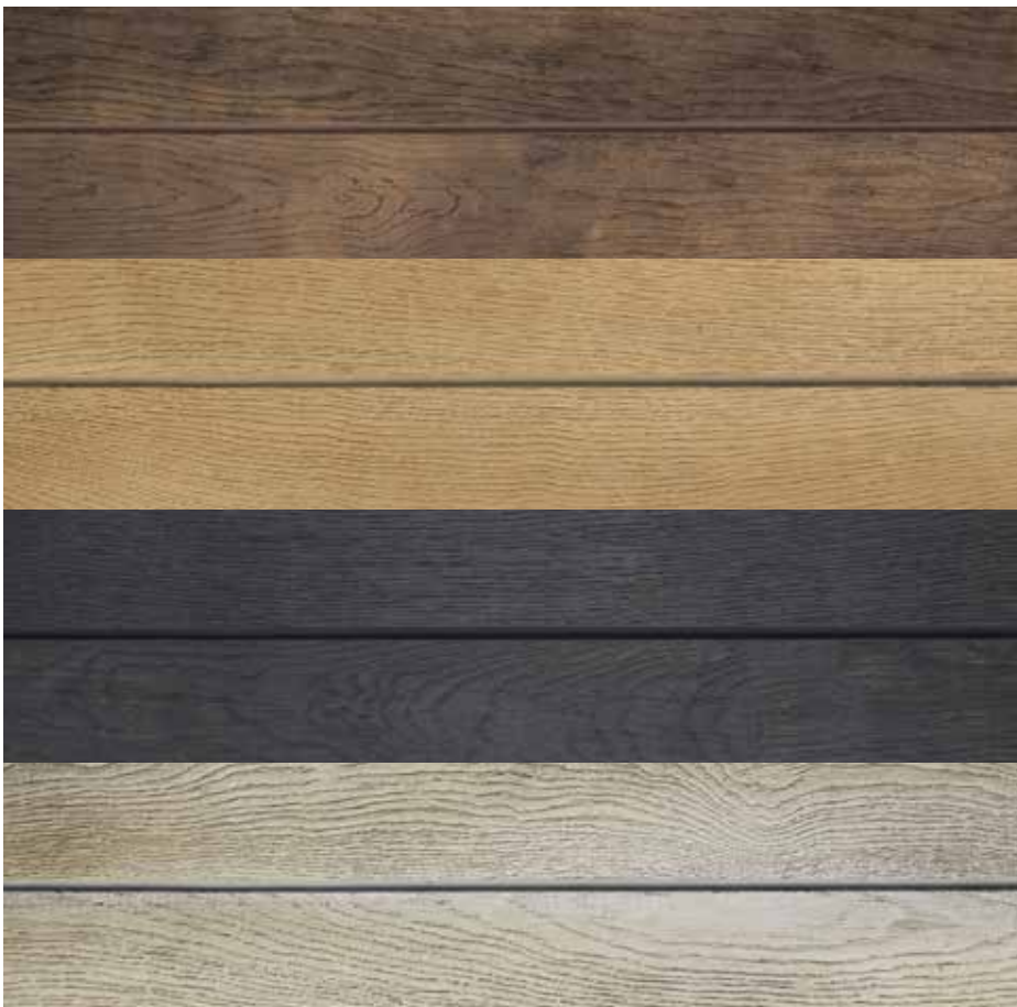
◀ Antique Oak MCG360A

The Shadow Line board has been designed to perfectly replicate smooth timber with a flat grained finish, giving a clean authentic look. The increased width of the Shadow Line board compared to standard timber boards means that there is larger grain detail. This gives an enhanced visual impact, without the risk of the board twisting or warping over time. The Shadow Line board has been profiled with oblique angles to prevent water collecting between two profiles, as well as helping rain water wash over the face of the cladding. The indent created between boards gives visual definition to the individual grain patterns.