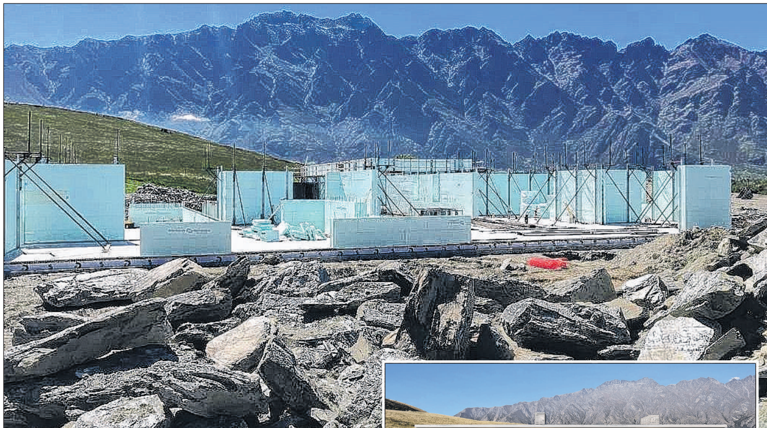
Another block in the wall: This Jack's Point house build employed a southern hemisphere-record 980sqm of Nudura insulated concrete formwork; inset, the finished product

Chisholm's company has supplied, and often also installed, Nudura for 150-plus buildings, mostly in and around Queenstown, over the past 10