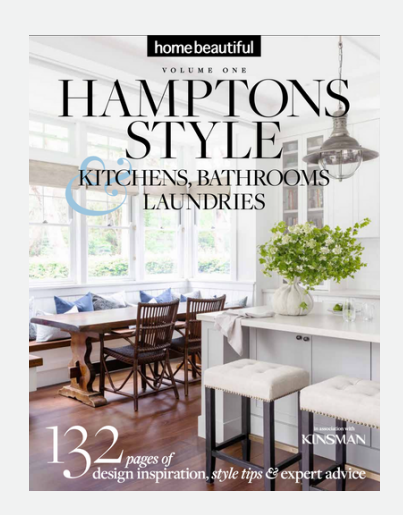
Home Beautiful, April 2023 Neutral Bay House