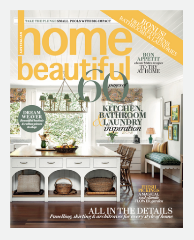
Home Beautiful, Sept 2023 Roseville House