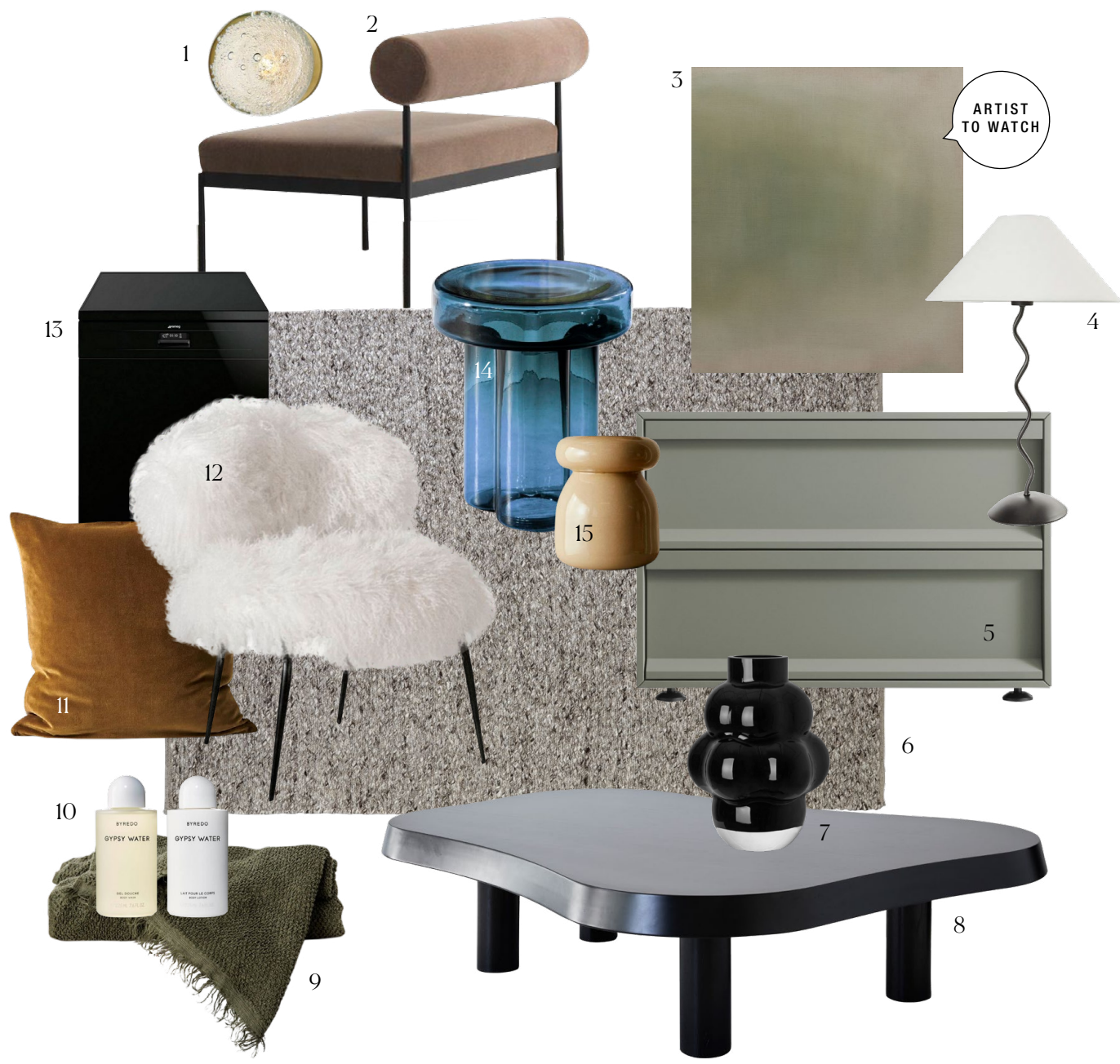
1 Fizi wall sconce, from $1900, Articolo Lighting. 2 Simon James Design 'Miller' lounge chair, from $2809, District. 3 The Green River II artwork by Indivi Sutton, $2800, Saint Cloche. 4 Percy table lamp, $379, McMullin & Co. 5 Superchoice night stand, $1095, Blu Dot. 6 Andes wool rug in Charcoal (3x4m), $3885, Armadillo. 7 Balloon vase by Louise Roe, $495, Spence & Lyda. 8 Organic coffee table, from $4550 for small, Madeleine Blanchfield Architects. 9 Pure Linen bath towel in Forest, $85, Cultiver. 10 Byredo 'Gypsy Water' body wash, $70, and body lotion, $86, Mecca. 11 Luxury velvet cushion in Tobacco, $79, Aura Home. 12 Baxter 'Nepal' armchair, $5015, Space. 13 Smeg 60cm 'Diamond Series' dishwasher, $1690, Harvey Norman. 14 Miniforms 'Soda' blown-glass side table, from $2295, James Richardson Furniture. 15 Eleanor vase, $159, McMullin & Co.