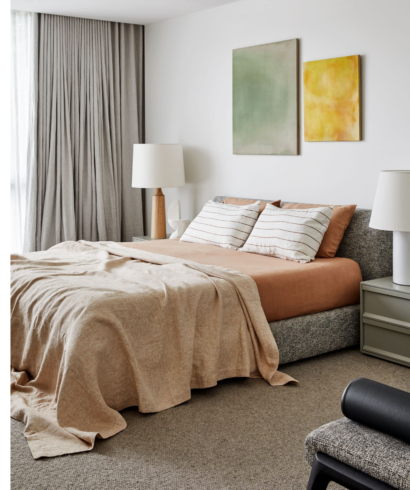
style tip When decorating a home you hope to resell, add personal preferences in the decor while keeping the bones of the structure universally appealing to maximise potential interest

CLOCKWISE FROM TOP LEFT Scalloped touches La Luna side table in Calacatta Nero from En Gold adds showstopping flair, complemented by the scalloped lines of the McMullin & Co lamp. Linen duvet set and flat sheet, Cultiver. Cellar Feels candle, Curionoir. Raise me up The stairwell continues the black, white and timber palette of the entranceway with art by Ben Mazey, C. Gallery, Sophie Nolan ceramic stool and an Apparatus pendant light from Criteria. Brain power Simple finishes win out in the study. Desk and chair, Jardan. Yellow unit, Space with Sophie Nolan ceramic vessel and Pomegranate in Scented Terracotta, Santa Maria Novella, on top. Vide Poche Rond in Bronze, Henry Wilson. OPPOSITE Rest and relaxation Bed, King. Bedside table, Blu Dot. The Green River II and Golden , by Indivi Sutton, Saint Cloche. Eagle sculpture by Humble Matter, Curatorial & Co. Pinch Derome table lamp in Ash, Spence & Lyda. Linen sheet set with pillowcases in Fawn and Cedar Stripe and Chambray bedcover, Cultiver. →