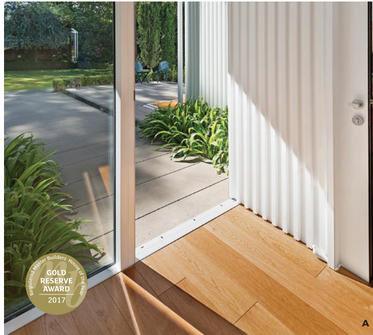
A Fendalton House Full height entry pivot door with pine timber battens against the American oak floor.