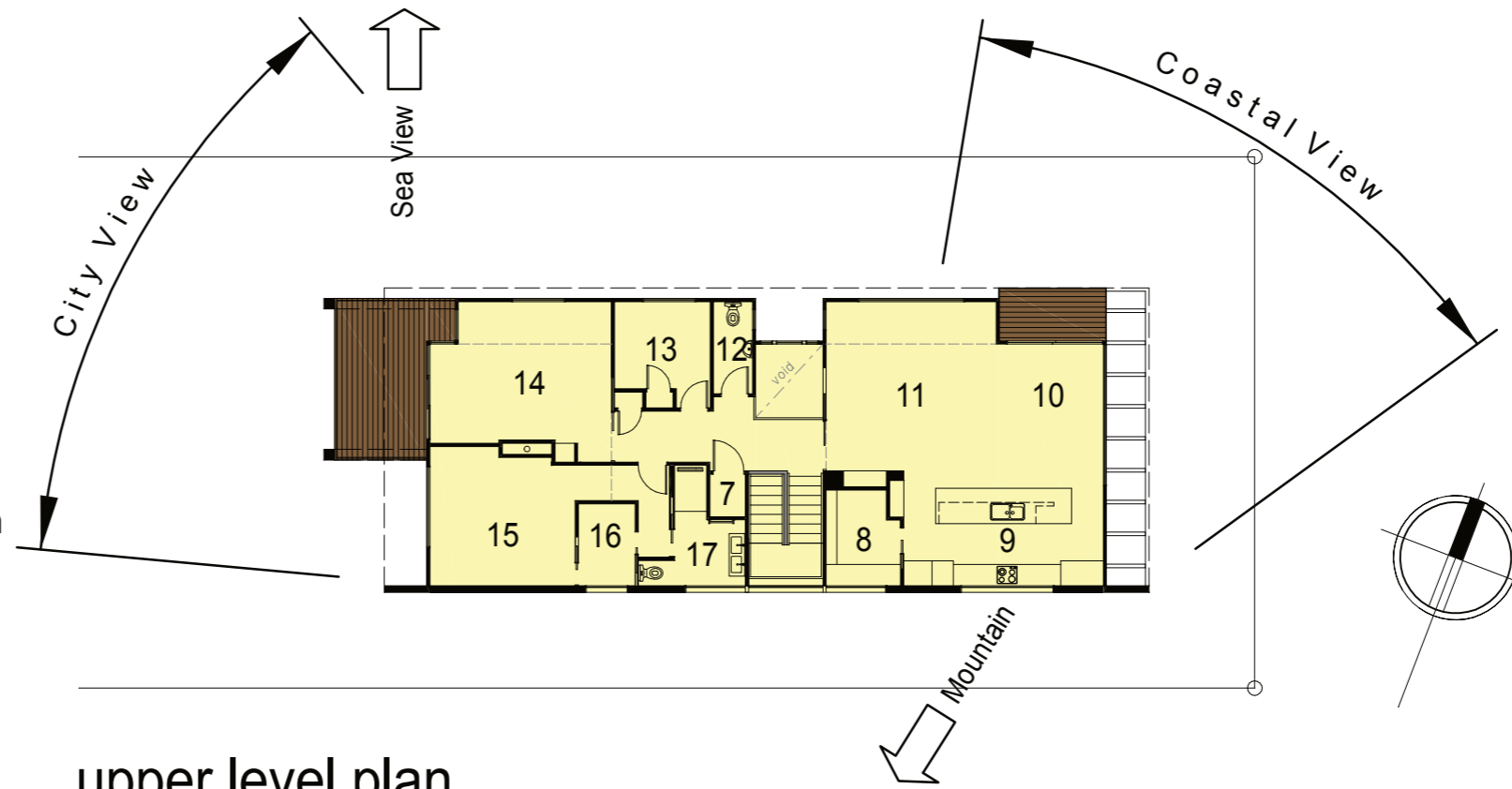
upper level plan