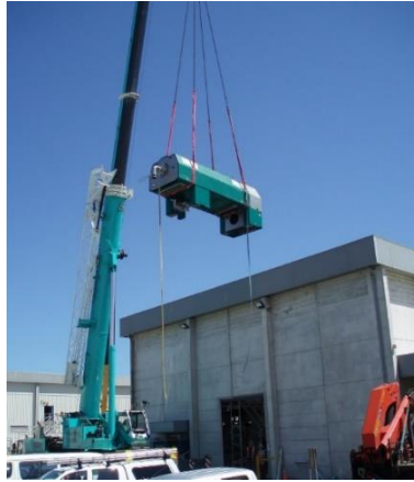
Mangere WWTP, Centrifuge and Conveyor Upgrades, Watercare Services

transfer conveyors at Watercare's Mangere treatment plant.