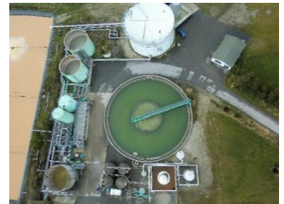
Edendale Dairy Factory, South Waikato District Council

Procurement Strategies – The primary objective of the procurement strategy is to obtain best value for money spent. In using a specific procurement method we ensure the client gives regard to the broad economic, environmental and social purpose of the organisation, and to the desirability of competition.