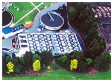
Tokoroa STP, South Waikato District Council

Preliminary Design Reports - incorporating design calculations, process description, control philosophy and design parameters. P&ID's, PFD's and plant layout drawings. Preliminary Equipment and Instrument Schedules.