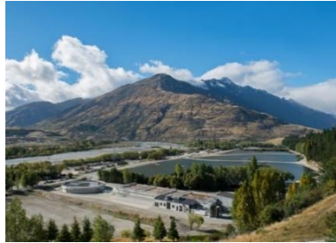
Project Shotover WWTP, Queenstown Lakes District Council

Our brand essence, Creative Thinking | Better Environments drives the approach to all our work. We always put a premium on the quality of our output, and its relevance to your needs.