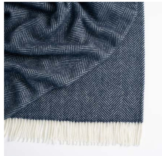
MAGNUS NAVY Herringbone 100% New Zealand Wool 150 x 183cm