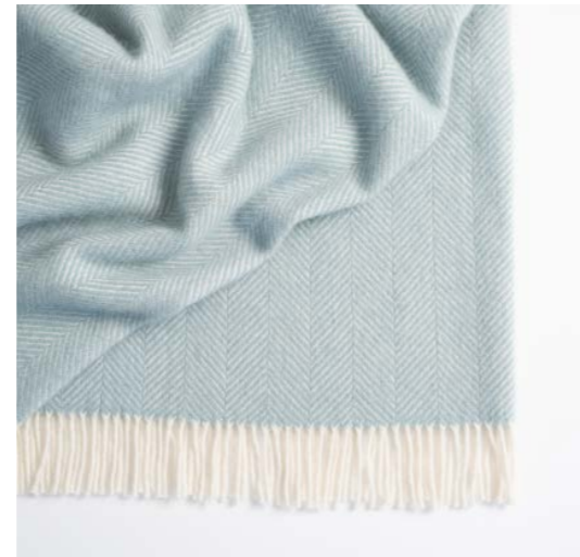
MAGNUS DUCK EGG Herringbone 100% New Zealand Wool 150 x 183cm