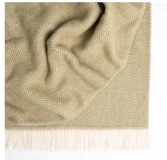
NORDIC PEA Diamond twill 100% Wool 140 x 240cm