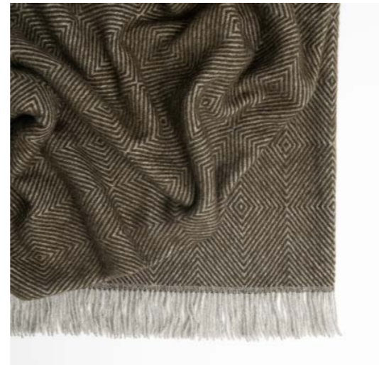
NORDIC KELP Diamond twill 100% Wool 140 x 240cm