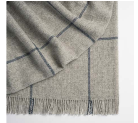
RANFURLY ASH All-over check 100% Wool 140 x 240cm