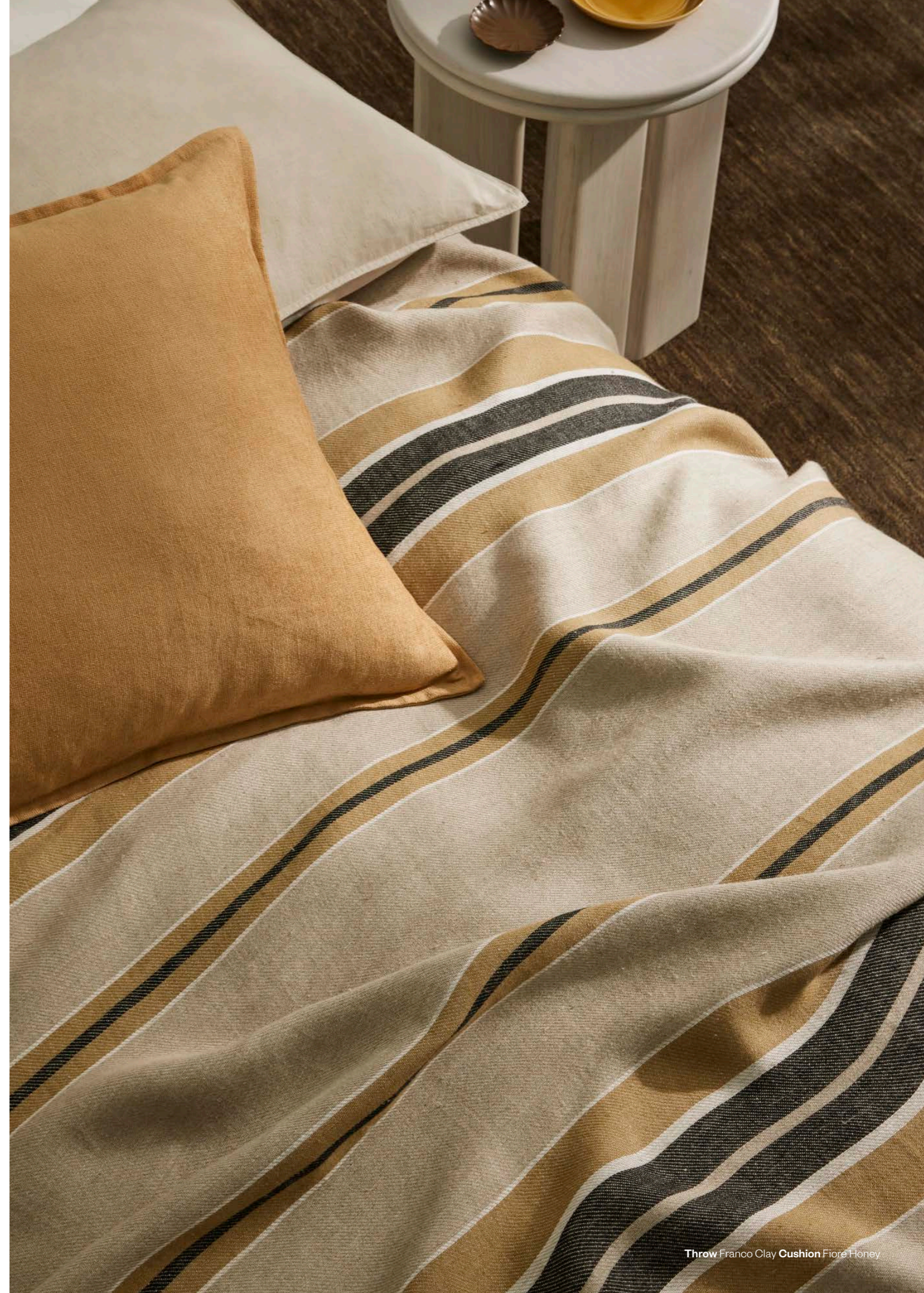
Throw Franco Clay Cushion Fiore Honey

Variegated stripe 100% European Linen 150 x 240cm