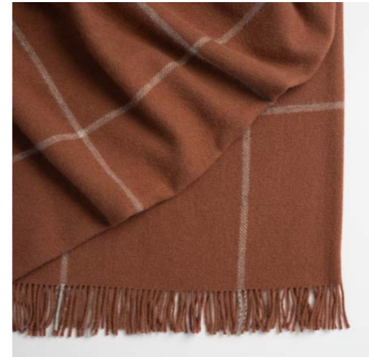
RANFURLY EARTH All-over check 100% Wool 140 x 240cm