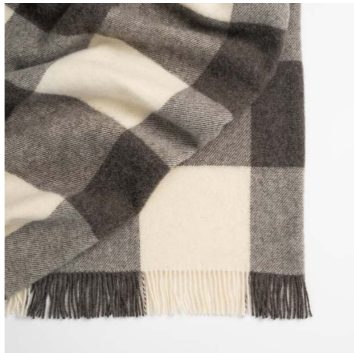
LAKE HAYES PEAT All-over check 100% Wool 140 x 240cm