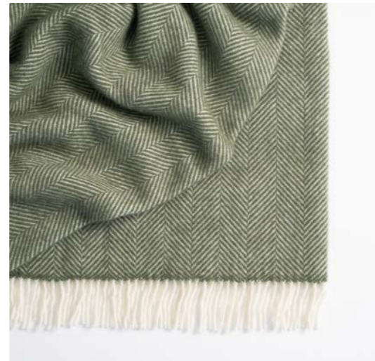
MAGNUS OLIVE Herringbone 100% New Zealand Wool 150 x 183cm