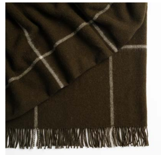
RANFURLY KELP All-over check 100% Wool 140 x 240cm