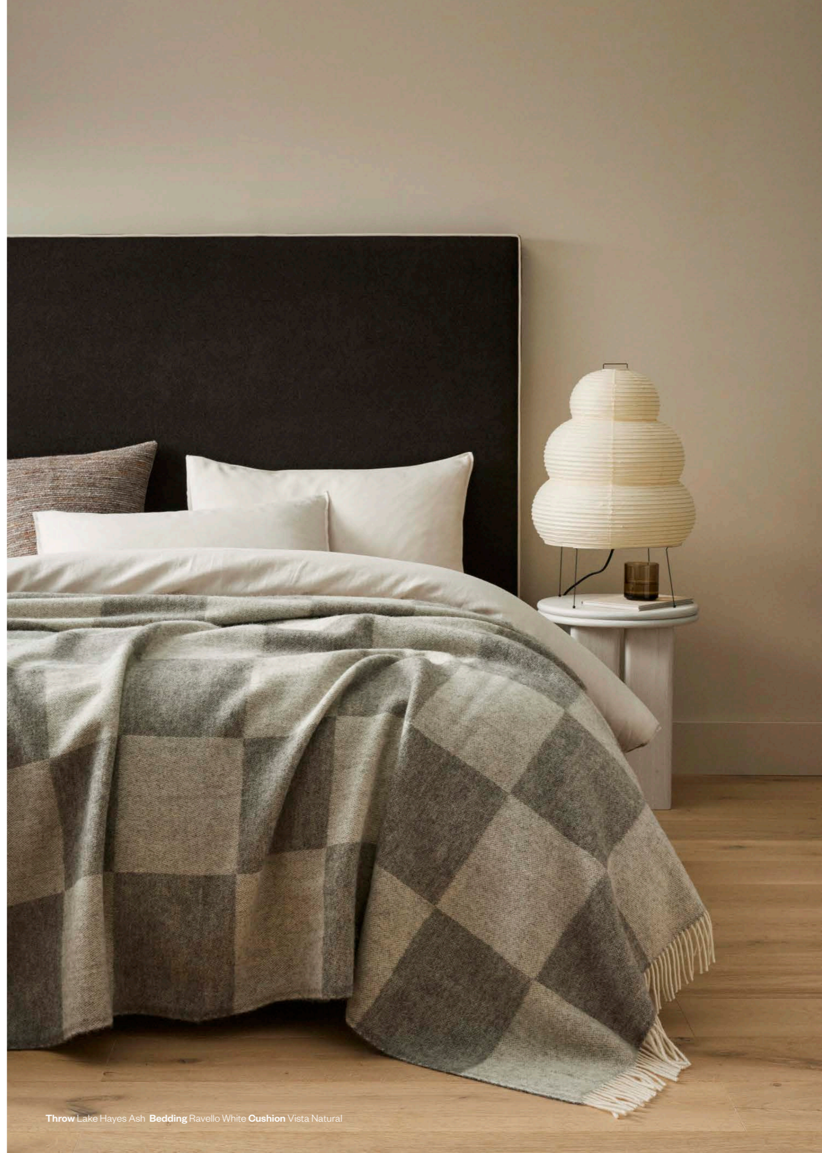
Throw Lake Hayes Ash Bedding Ravello White Cushion Vista Natural