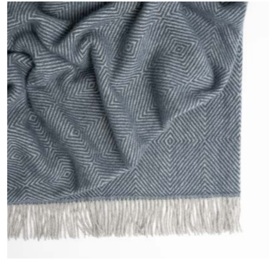
NORDIC MARINE Diamond twill 100% Wool 140 x 240cm