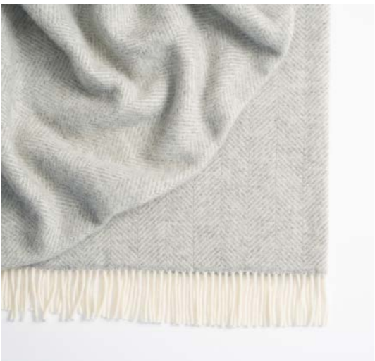
MAGNUS GREY Herringbone 100% New Zealand Wool 150 x 183cm