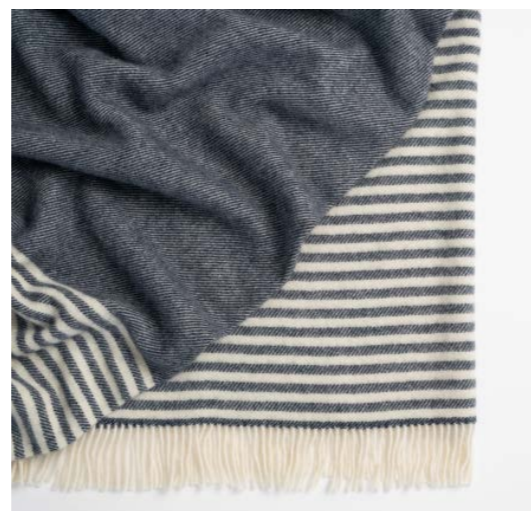
CATLINS CREAM / NAVY Striped double border 100% Wool 140 x 240cm