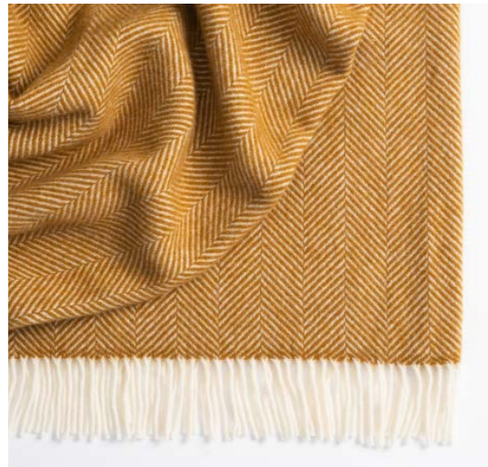
MAGNUS AMBER Herringbone 100% New Zealand Wool 150 x 183cm