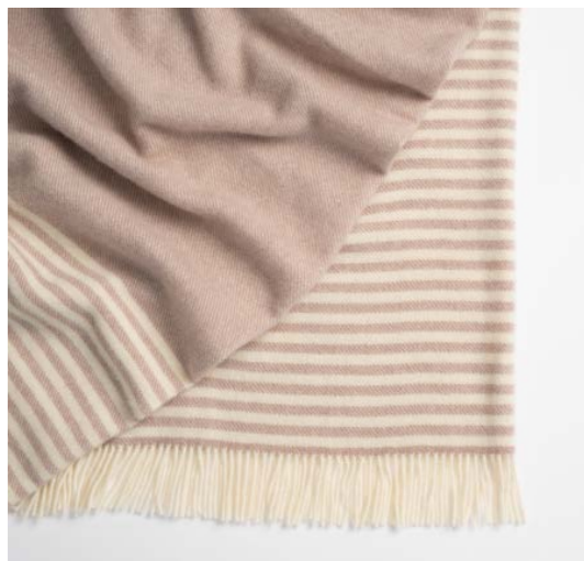
CATLINS CREAM / ROSE Striped double border 100% Wool 140 x 240cm