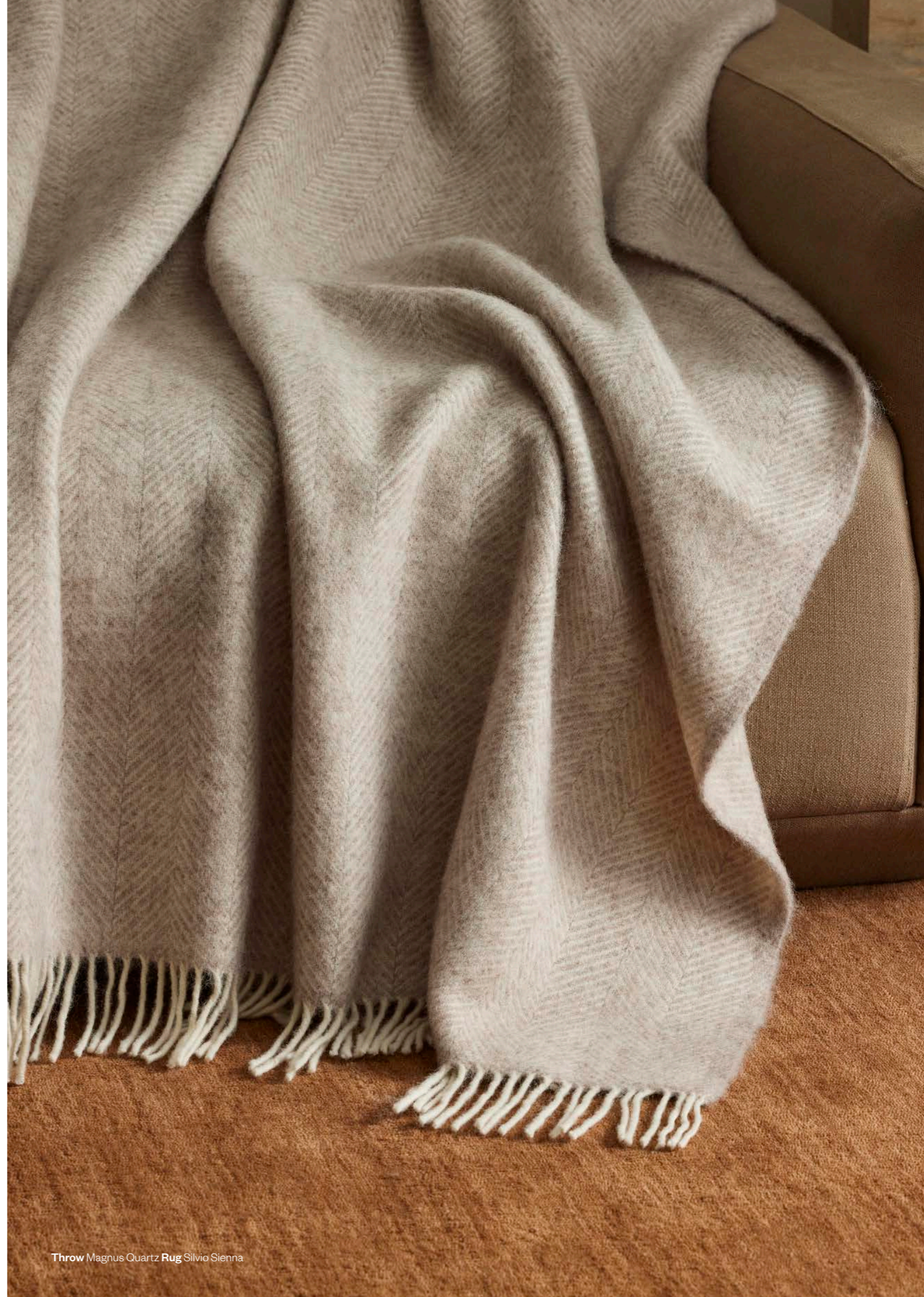
Throw Magnus Quartz Rug Silvio Sienna