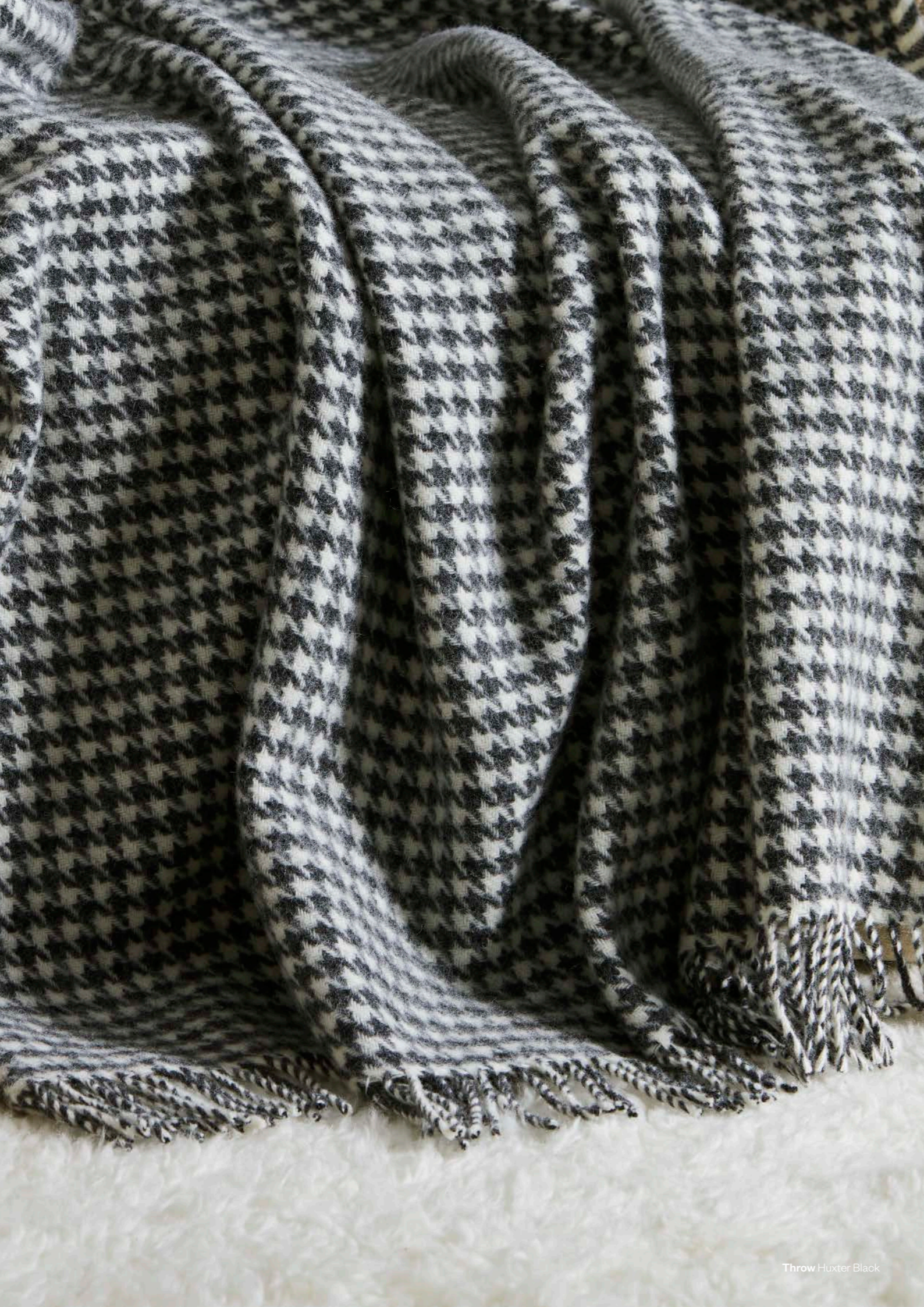
Throw Huxter Black