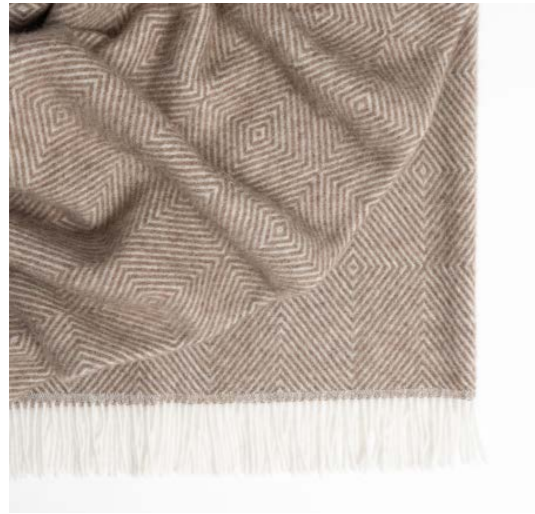
NORDIC OAK Diamond twill 100% Wool 140 x 240cm