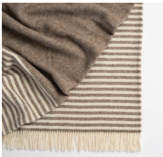
CATLINS CREAM / BROWN Striped double border 100% Wool 140 x 240cm