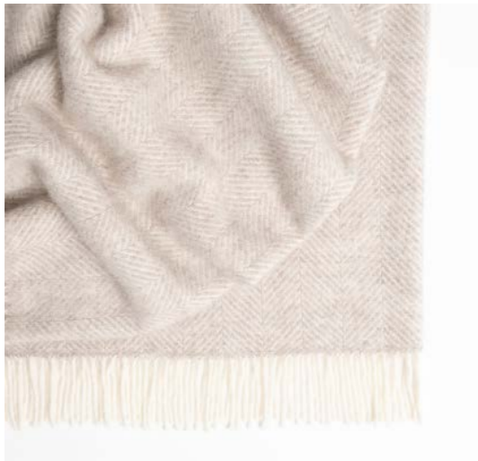
MAGNUS QUARTZ* Herringbone 100% New Zealand Wool 150 x 183cm