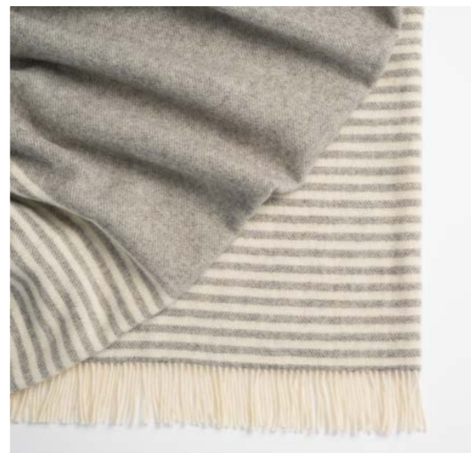
CATLINS CREAM / ASH Striped double border 100% Wool 140 x 240cm