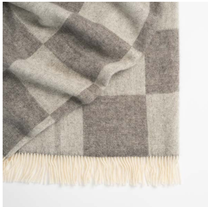
LAKE HAYES ASH All-over check 100% Wool 140 x 240cm