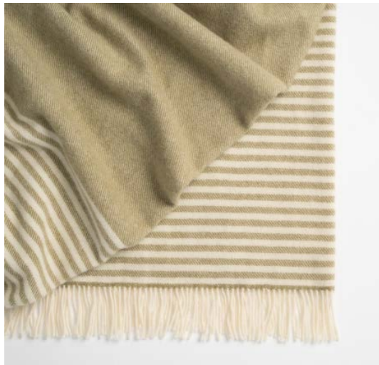
CATLINS CREAM / PEA Striped double border 100% Wool 140 x 240cm