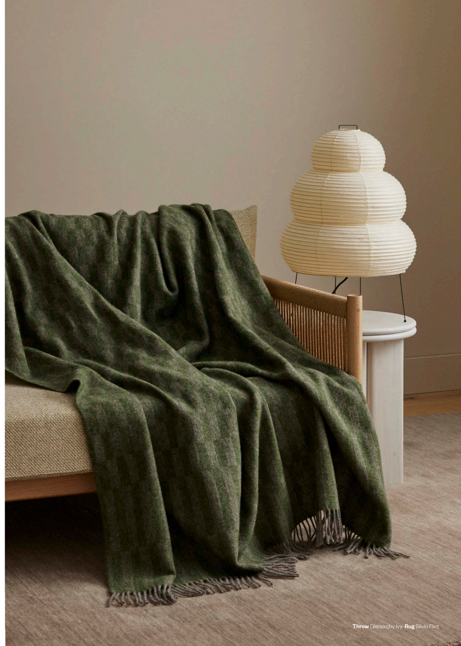
Throw Glenorchy Ivy Rug Silvio Flint

Variegated rectangle checkerboard 100% Wool 140 x 240cm