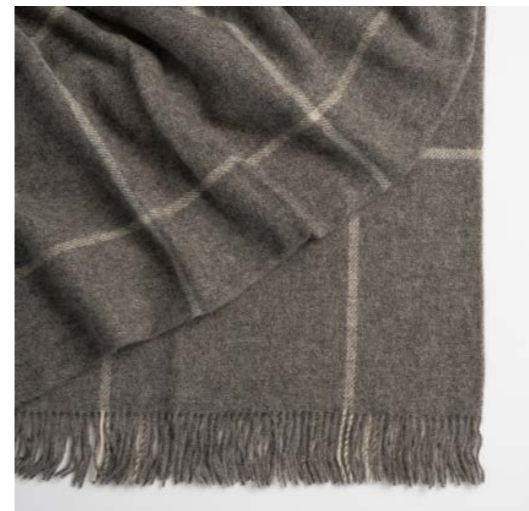
RANFURLY CHARCOAL All-over check 100% Wool 140 x 240cm