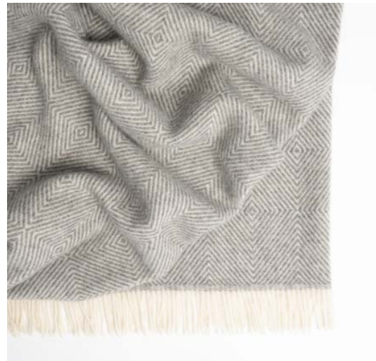
NORDIC ASH Diamond twill 100% Wool 140 x 240cm