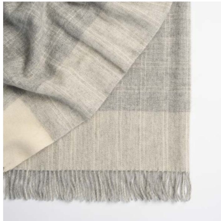
CROMWELL ASH Plaid 100% Wool 140 x 240cm