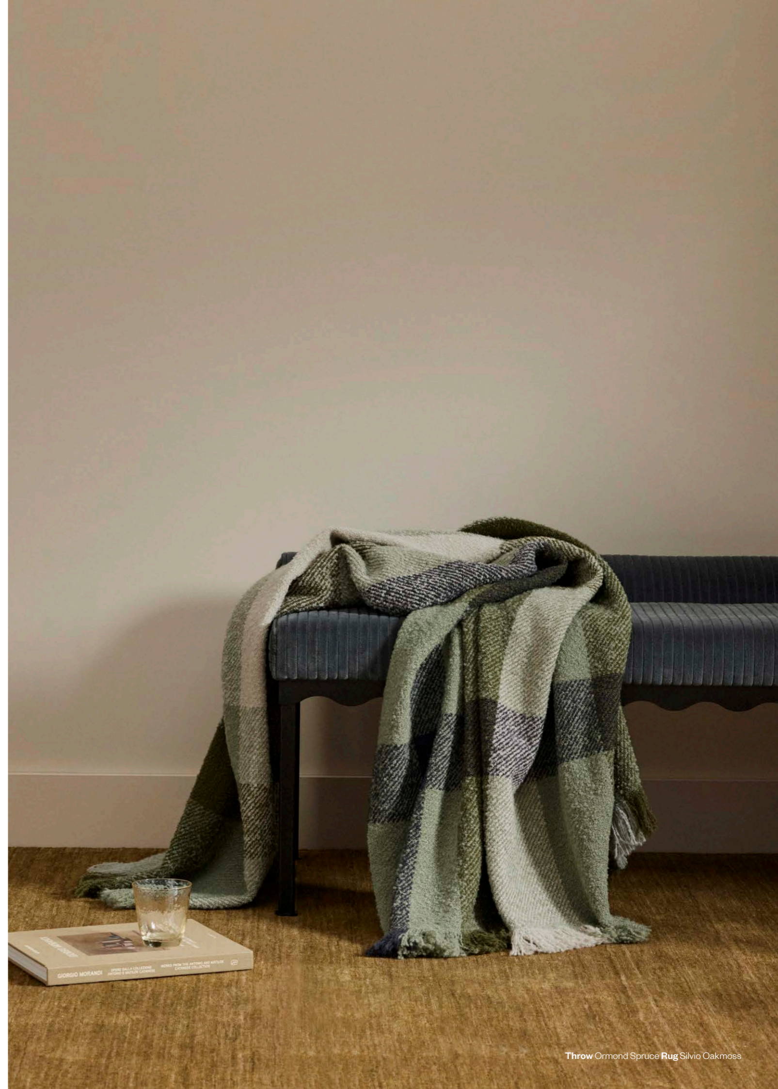
Throw Ormond Spruce Rug Silvio Oakmoss

Boucle twill window check 95% New Zealand Wool 5% Nylon 130 x 200cm