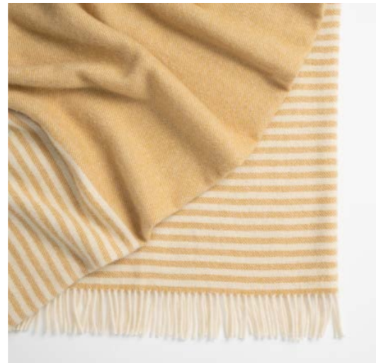
CATLINS CREAM / BUTTERSCOTCH Striped double border 100% Wool 140 x 240cm