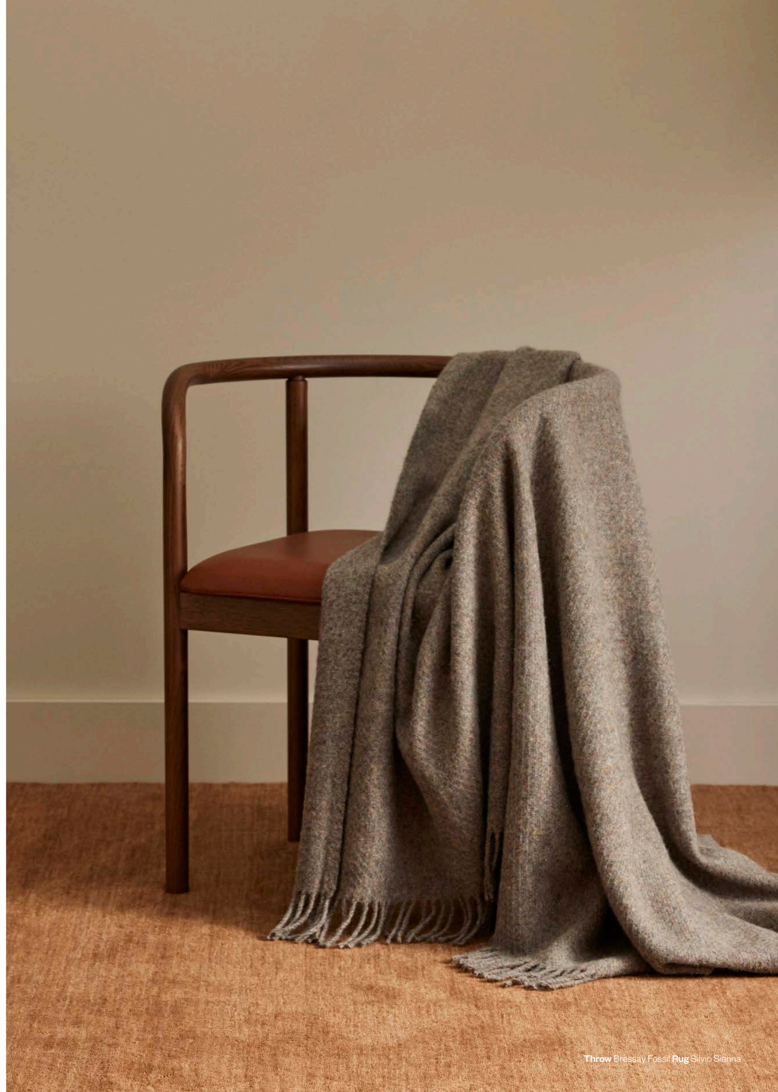
Throw Bressay Fossil Rug Silvio Sienna

Twill with marled colour 50% Recycled Wool 50% New Zealand Wool 150 x 183cm