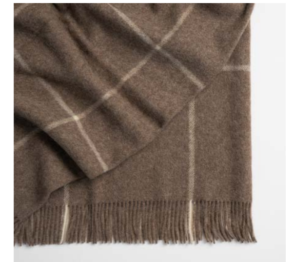
RANFURLY OAK All-over check 100% Wool 140 x 240cm