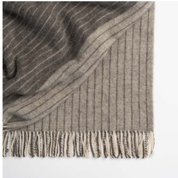
CLYDE CHARCOAL Two panel with inverted pinstripe 100% Wool 140 x 240cm