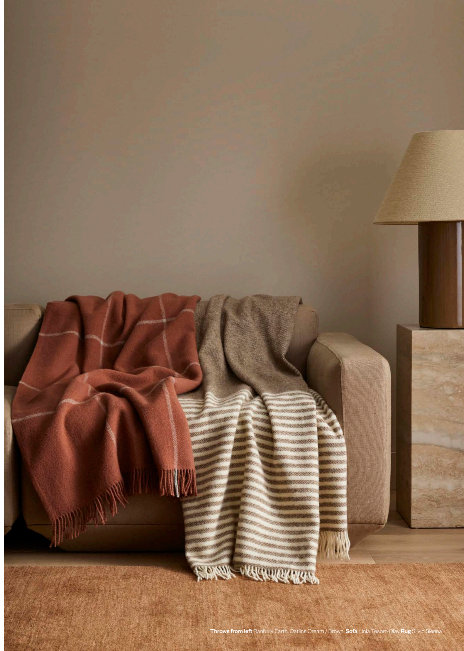
Throws from left Ranfurly Earth, Catlins Cream / Brown, Sofa Linia, Tesoro Clay Rug Silvio Sienna