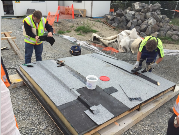
Preparation of the Duo mock roof