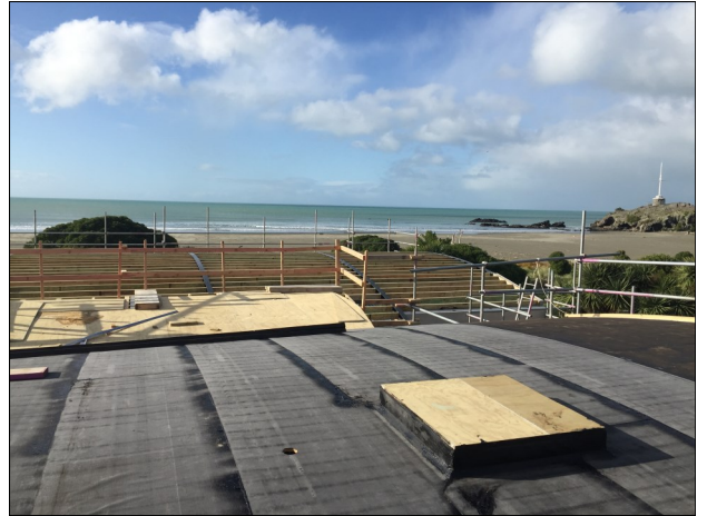
Installation of the Duo basesheet over plywood